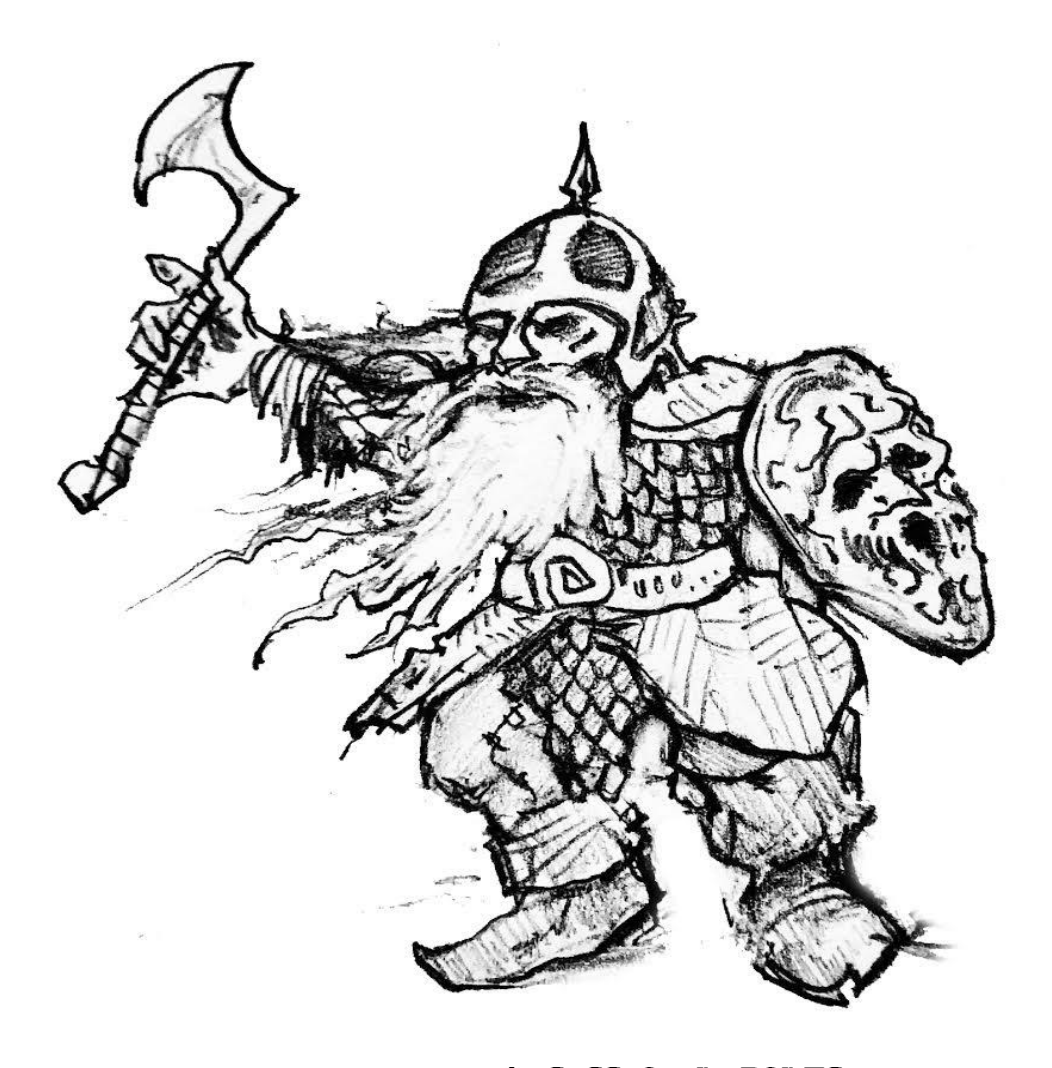
IV. SESSION REPORTS

B. Zimbabwoo, Demon Lord of the 276<sup>th</sup> Plane of the Abyss: What kind of demon is Zimbabwoo? Heh, He's the kind of demon that will "pick you up with both hands, play your body like a freakin' accordion until your bones pop out, stick a straw down your throat and slurp up all your blood before casually chucking your cadaver into the bowels of the Abyss." Good Times! Below is a drawing of Chester the Dwarft