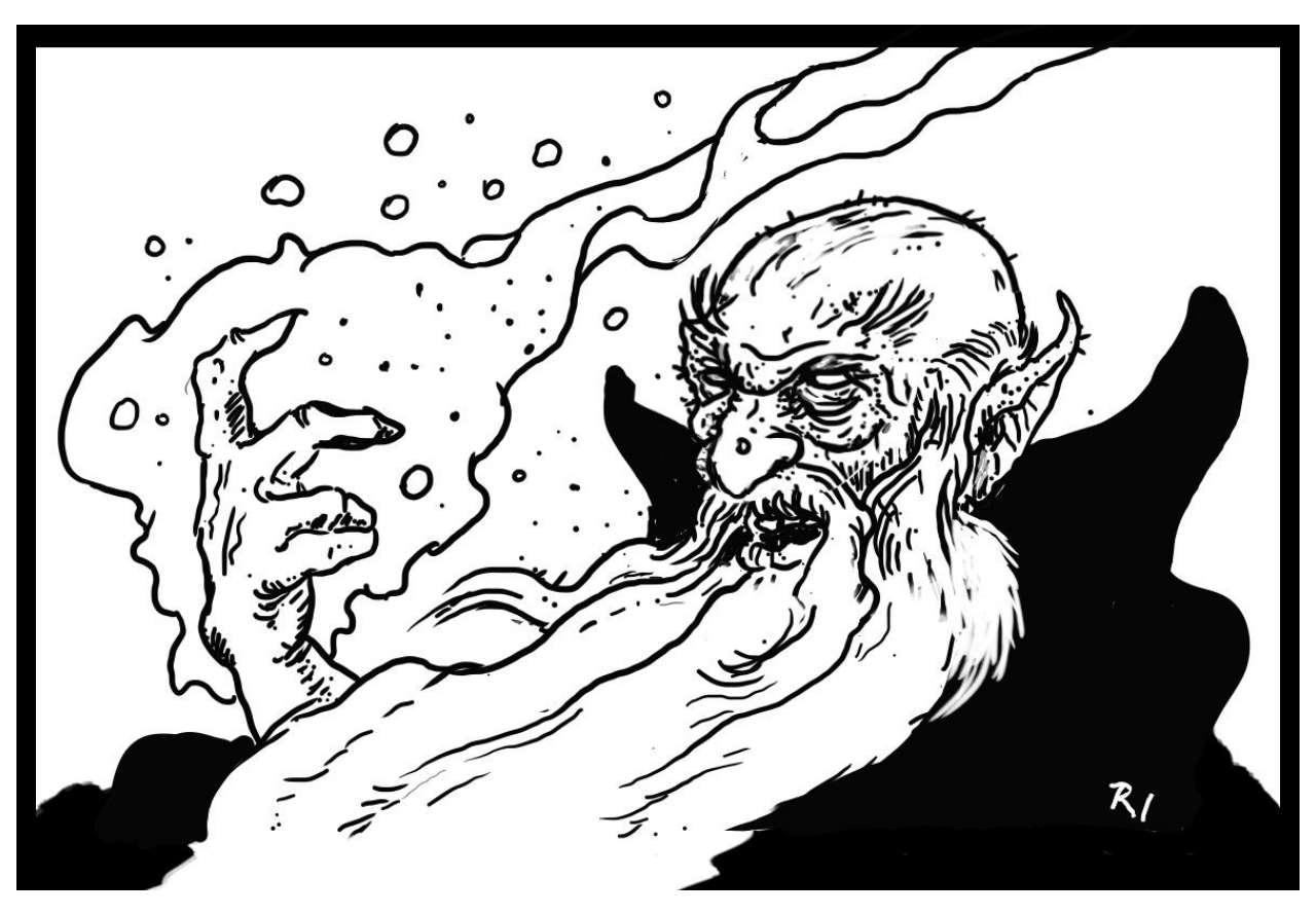
Wizard Funk is © 2019 Dicebro Games

AN AMATEUR MAGAZINE FOR ORIGINAL FANTASY RPG ENTHUSIASTS Issue 1 20April2019 1 dollar