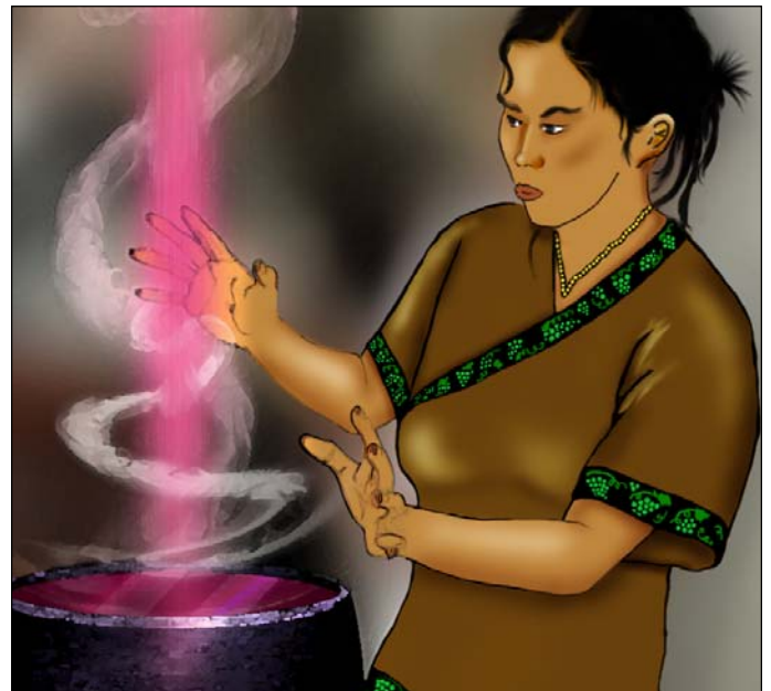
Ecjoy, priestess of Olidammara, changes water to wine for an upcoming festival.

When Olidammara was trapped by Zagyg, the Mad Archmage forced him into the shape of a animal with a carapace as