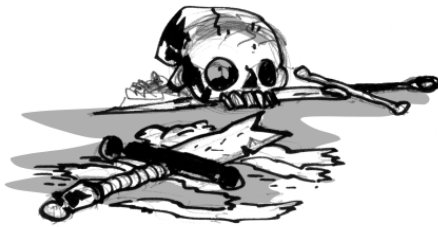
Table 2: Sword Monger Titles