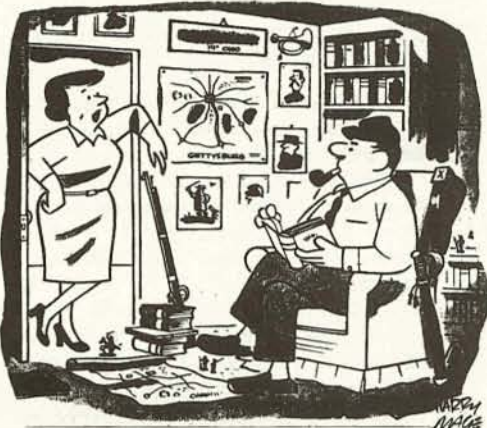
"When does one stop being a wargame 'buff' and become a wargame 'nut'?"

SEARCH ESCAPE- Ships going into the Skagerrak are only escaping temporarily. In order to conform to any of the above conditions they must eventually return to the above named bases.