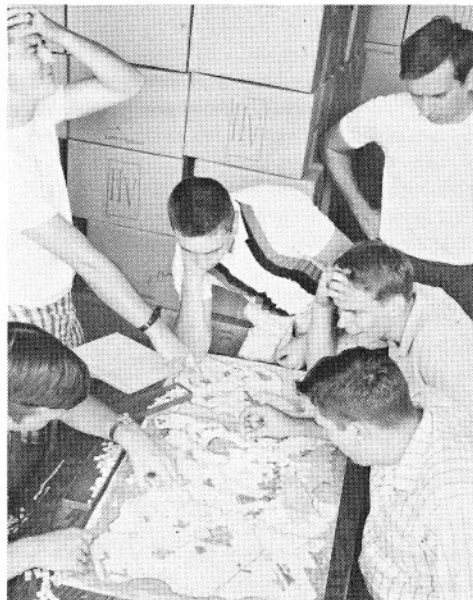
BOB'S BLUNDER: Consumer Panel testers intently analyse a strategic mistake during an exhaustive test game of a Blitzkrieg prototype.

Basically a two-player game, players must attack and defend over every type of terrain imaginable - from invading rocky-bound coasts to holding up in mountainous areas. Combatants must also cross the Great Koufax Desert (so named because it is sandy) to sieze enemy replacement centers. Judicious use of air power often turns the tide of the struggle - combat occurs fast and furiously keeping players on their strategical toes. "Blitzkrieg" has