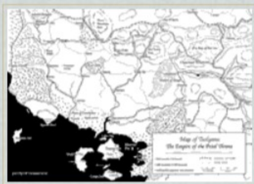
Map of Tsolyánu click to download larger version]

As a tie-in to the feature on Pala Jakálla, we take a closer look at this seafaring clan.