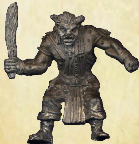
Troll w/ Club Heartbreaker ED-329