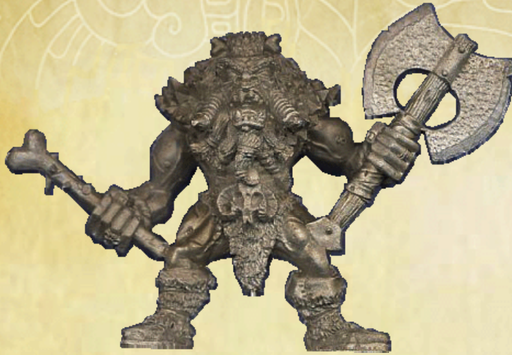
Bloodlore Troll Heartbreaker ED-347