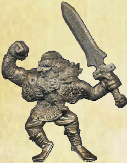
Skyraider w/ Sword Heartbreaker ED-343