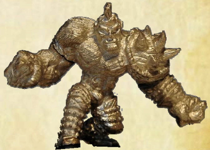
Troll Brawler Ral-Partha mkm-522