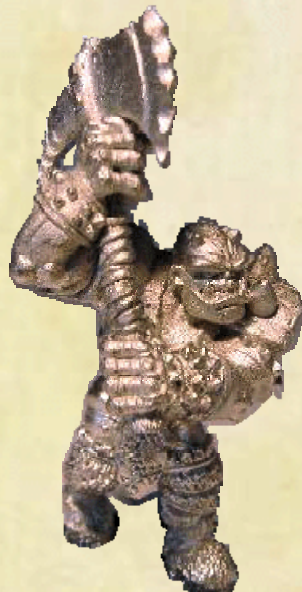
Half-Troll Hacker Ral-Partha mkm-539