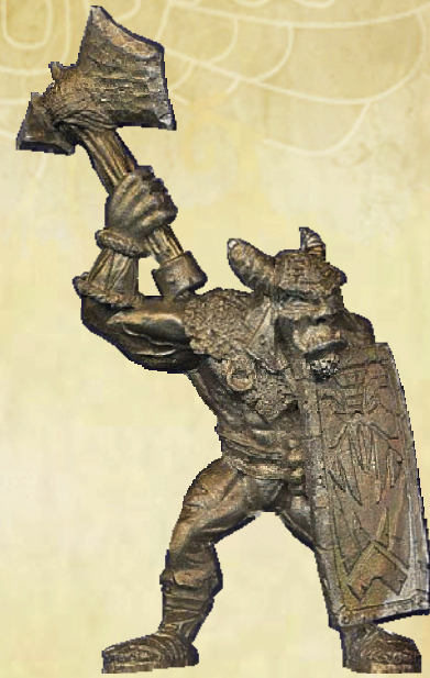
Southern Troll Heartbreaker ED-348