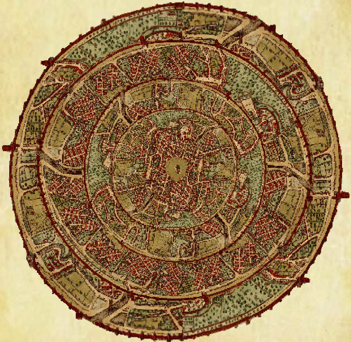
Dragons eye view of the City of Iopos.

The Malachite Throne is housed within the walls of the Central Spire. A few citizens are selected every year to tour the spire so that they may tell of the experience to their family and friends. This provides first hand accounts of the ruling family. In this way the Denairastas remain as real and personable as other people.