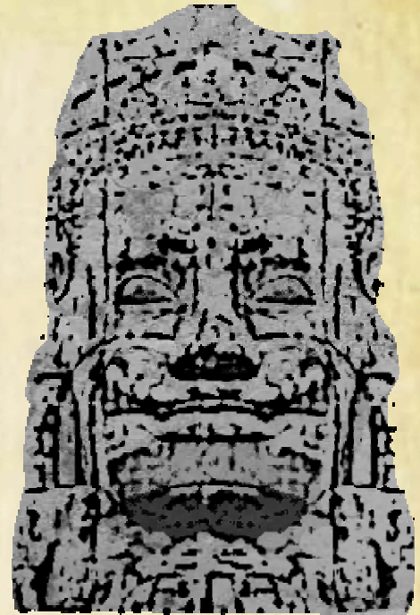
A furlong memorial carving

Great ceremonial magic is woven into the canal to help prevent it from being used as a weapon against Iopos, once it is complete. These ceremonies use life magic to reinforce the canal and its defenses. Willing volunteers from the city and the countryside provide the necessary materials for this magic.