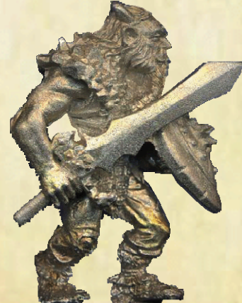
Crystal Raider w/ Sword & Shield Heartbreaker ED-305