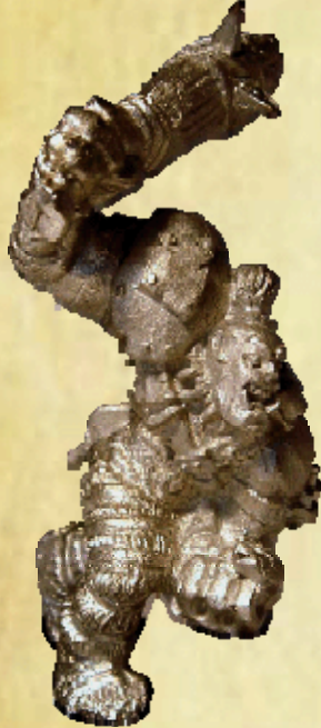
Tribal Brute Ral-Partha mkm-591