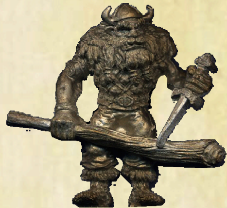
Troll w/ Club & Dagger Heartbreaker ED-306