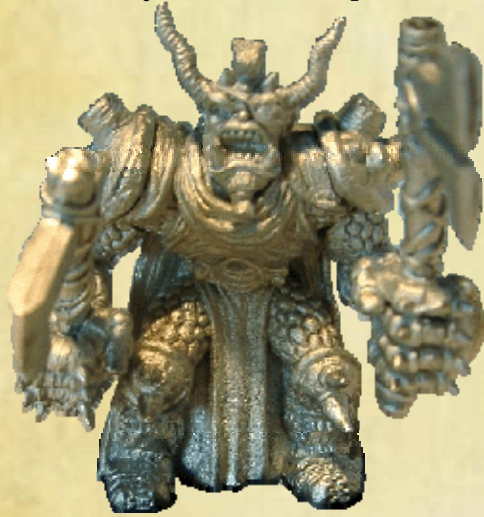
Troll Chieftain Ral-Partha mkm-551

These Trolls were not released for the Earthdawn line. They are part of the Limited Edition Mage Knight Metal miniatures line. However they work very well within the size and design style of the Earthdawn line and so I thought I would include them. There are of course plastic pre-painted versions of these miniatures to be found regularly. All of the plastic sculpts are of a lesser quality than the metal, and even miniatures with the same name look completely different as they were Re-sculpted for the Limited Edition Mage Knight Metal line