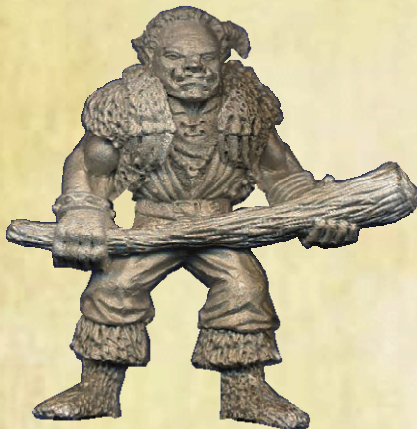
Torgak, Troll w/ Club Heartbreaker ED-349