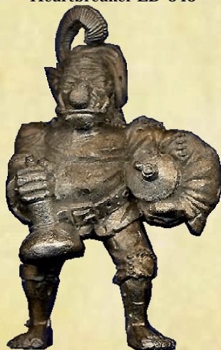
Inebriated Troll Heartbreaker ED-316