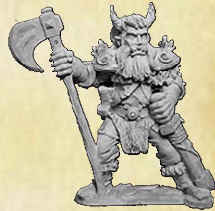
Targ Boneslicer Ral-Partha 20-002

These images are approximately 25mm in scale to give you an idea of the size of these miniatures.