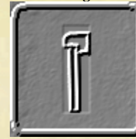
Threatening Weapon / Axe