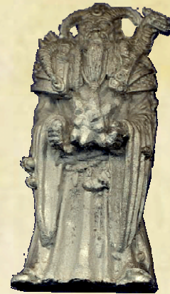
Troll Illusionist Heartbreaker ED-334