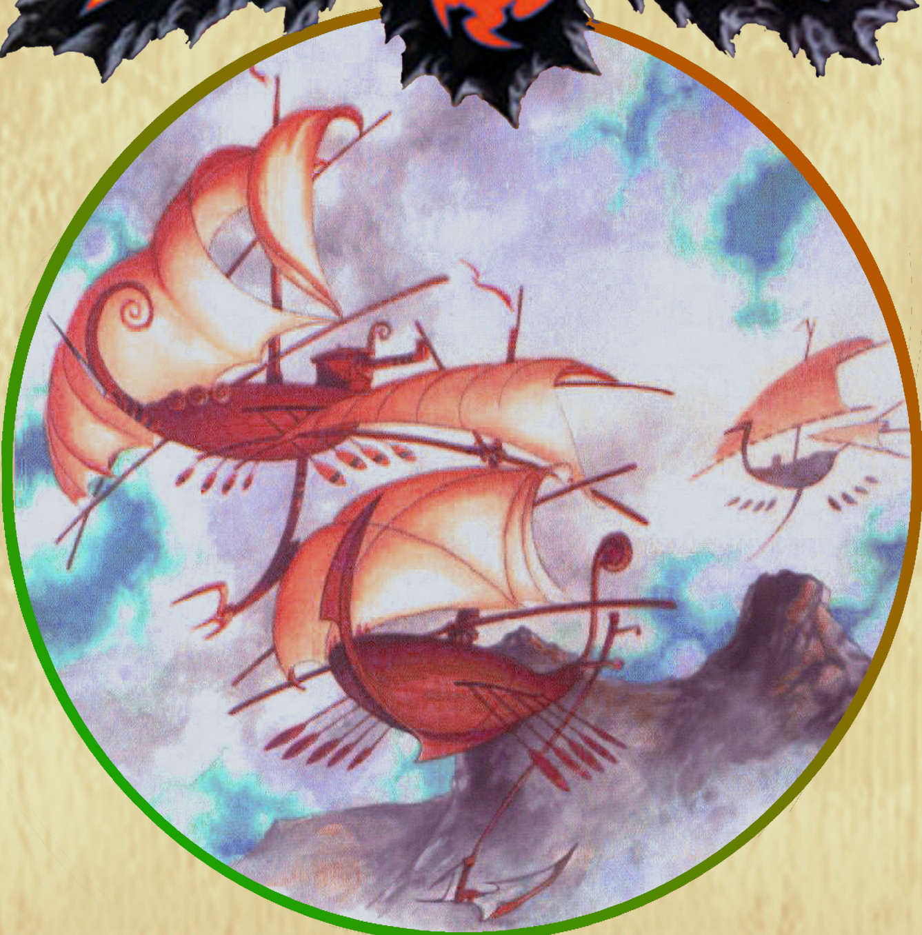
TABLEAU INFRACTUS #5