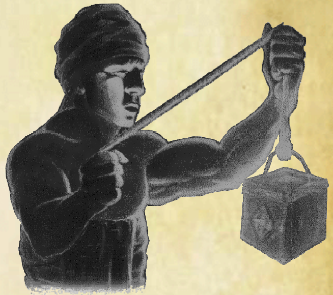
Iopan Wizard studying a cursed puzzle box.

Wizards, Nethermancers, Elementalists, and Illusionists, were registered and trained by minor members of the Denairastas family. This tradition still holds today. Every Iopan adept of these disciplines owes a great deal to the Denairastas for providing training and circle advancement. Even adepts from outside of Iopos may apply for training.