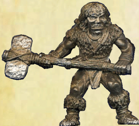
Cave Troll w/ Club Heartbreaker ED-340