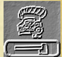
Dead Warrior Adept

This is the friendly warrior; the influence is in the Magical with an axe away from the warrior. The translation is a warrior adept at rest, or dead.