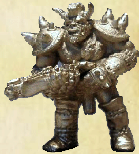
Troll Artillerist Ral-Partha mkm-522