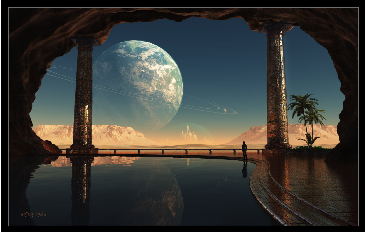
The Imperial Winter Palace, on the Cianji moon of Xanadu, 1438 Imperial.

The graphic is titled "Caves of Tau Ceti" ©Artur Rosa.