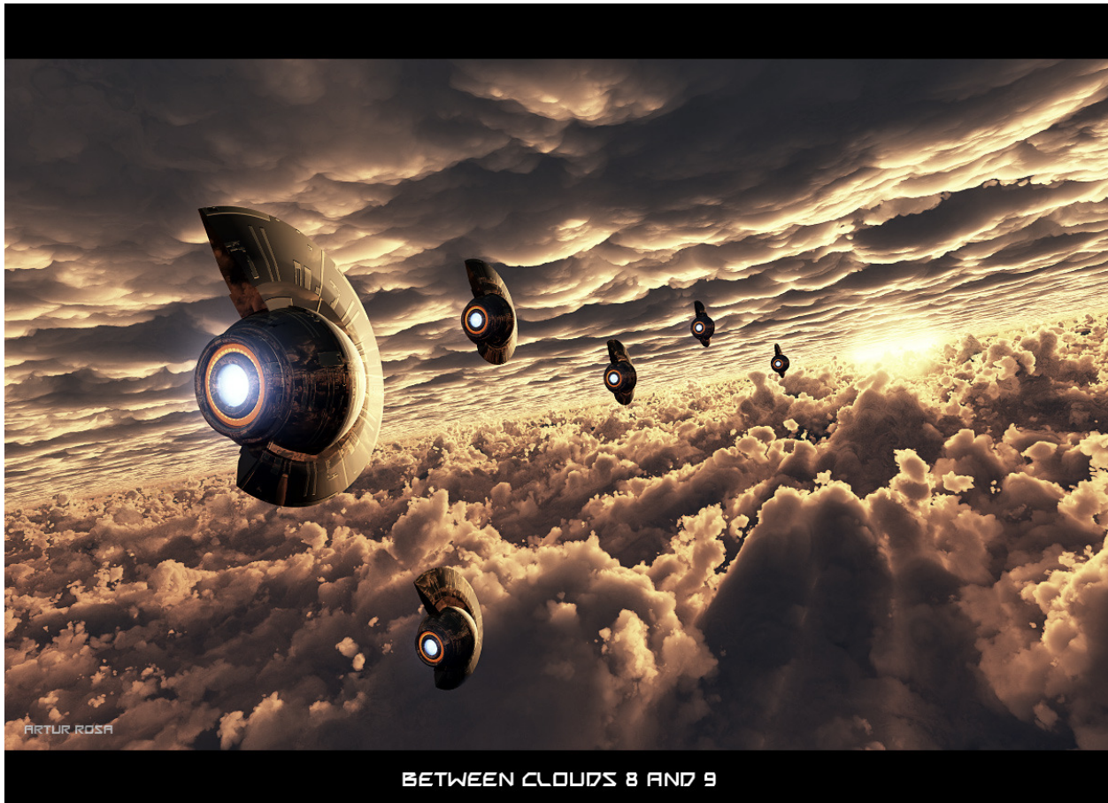
A team of Cianji Scouts explore the hostile yet beautiful world of Lorem Ipsum, in the Vintage system, 1205 Imperial. The graphic is titled “Between Clouds 8 and 9” ©Artur Rosa. Visit his gallery at http://arthurbblue.deviantart.com/gallery/?offset=72#/d2ufv62