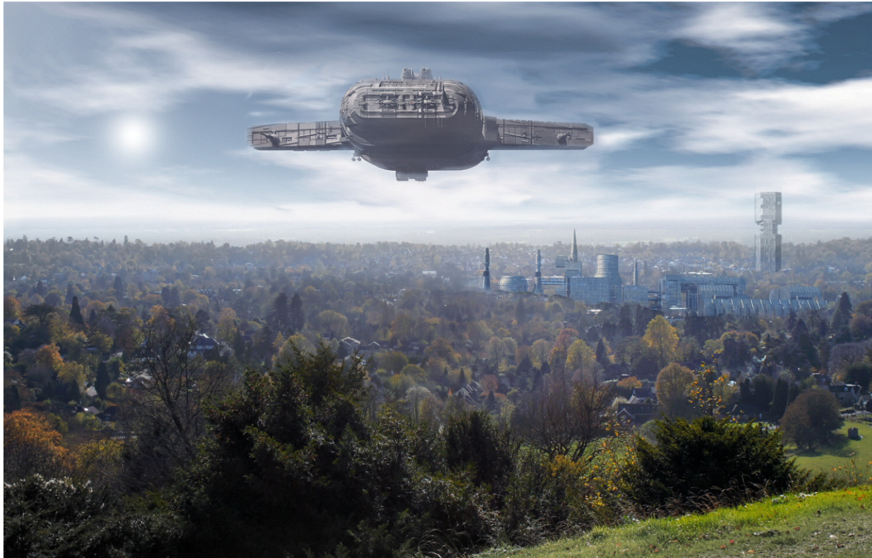
A locally built Free Trader, the Deo Confidimus, makes her first journey to near orbit. Moscow System, 1492 Imperial. This graphic is titled "Home Coming" © Puredigital101. Visit his gallery at http://www.renderosity.com/mod/gallery/index.php?image_id=1975984

construction yard over the Ziru Sirkaa capital world, with pureblood Solomani and Vilani men working hard for mutual profit. Var Kirat-Reborn Imperium relations are cordial but distant, while Var Kirat-Imperial Cianji relations are a good deal cooler, if still respectful. The Athenians are the closest in culture to the Var Kirat, but their irreverent attitude grates on the pious Var Kirat. Finally, the Var Kirat do all they can to ingrate themselves with the Human Council, but the Council leaders prefer to keep a fair amount of space between themselves and the Var Kirat.