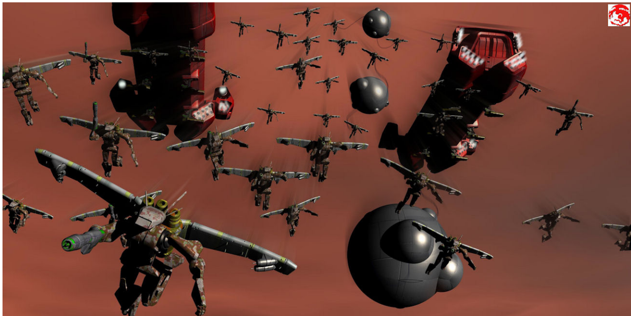
Assault on Valiant, 894 Imperial. This graphic is titled "Mars Assault Drop". Visit his gallery at http://www.renderosity.com/mod/gallery/index.php?image_id=1870012