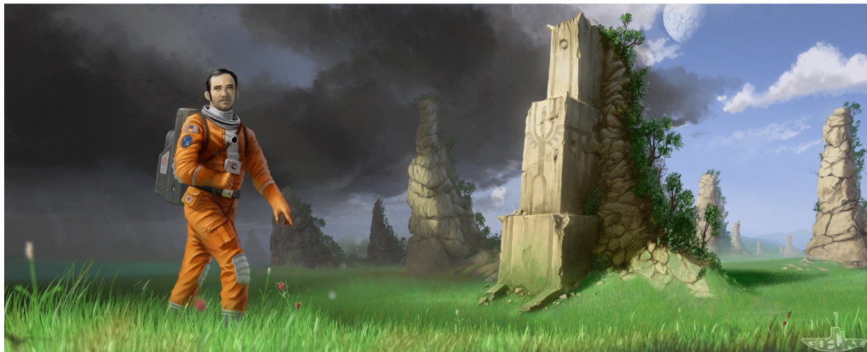
A Protectorate Researcher scans the ancient ruins that surround him. Providence/Painted, Starbreak sector. 1500 Imperial. This graphic is titled "A Planetary Survey"