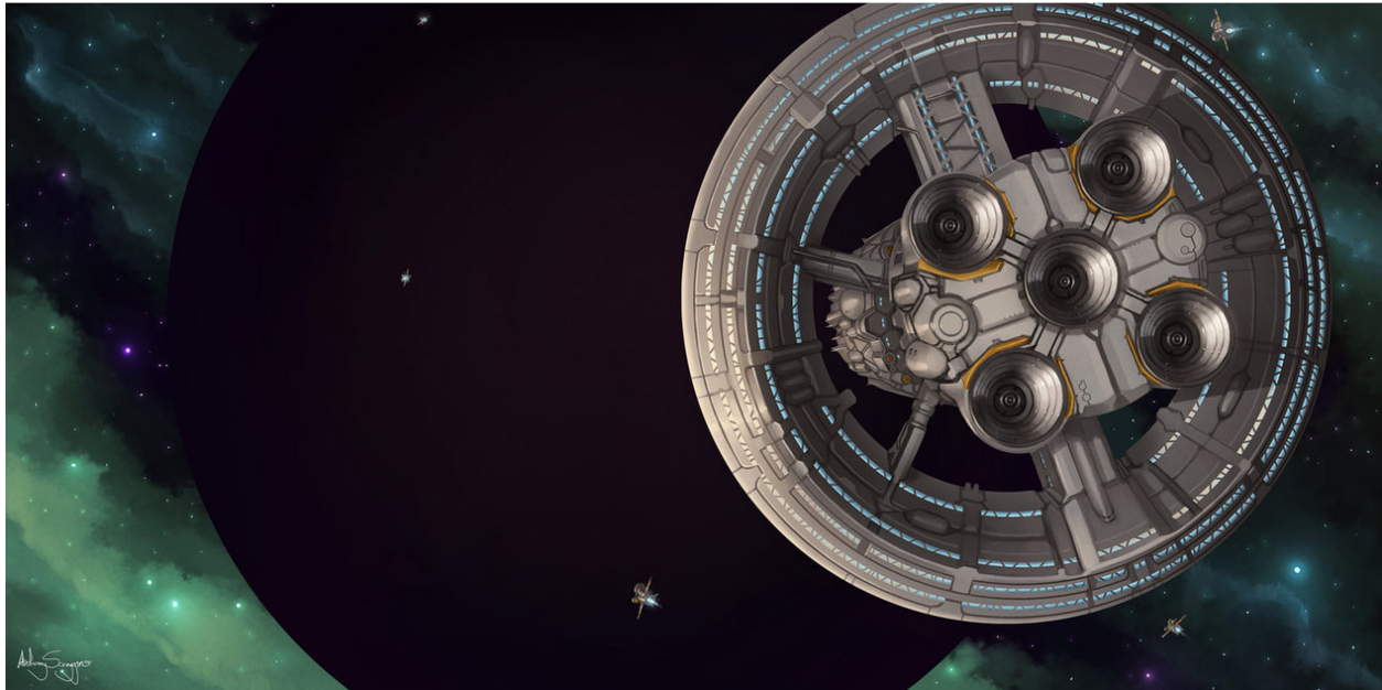
The Magyar Wanderer, a SolSec Scout, exploring Starbreak sector in 1043 Imperial.

This graphic is titled "Second Chance".