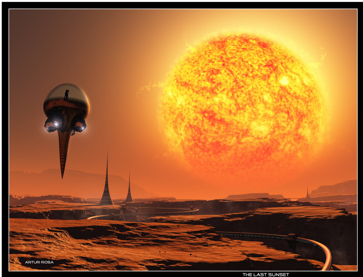
Et Alibi Imperial Scout Station on the world of Valiant, today's Dikaai, 723 Imperial. This graphic is titled "The Last Sunset"