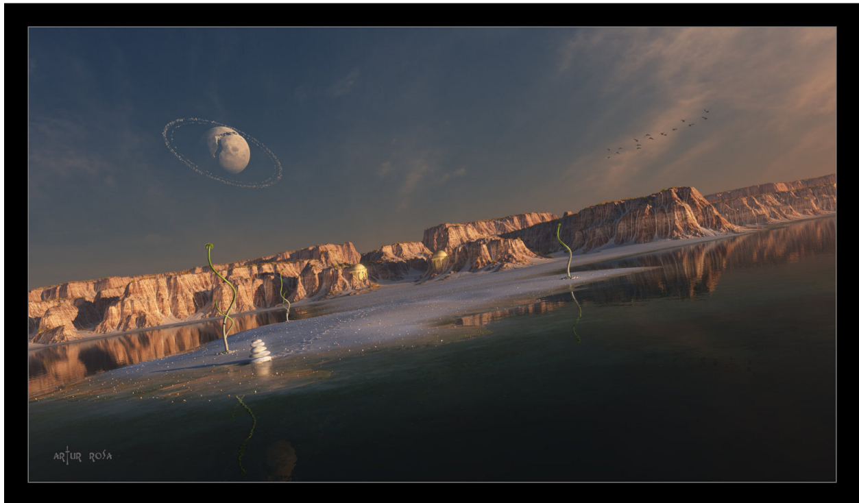
Watching the worldset of Teru from her sisterworld of Fenmou. Unlike Teru, ancient life continues to keep her grip on Fenmou. Fenmou system, 1406 Imperial. This graphic is titled "If You See the Five Stones"