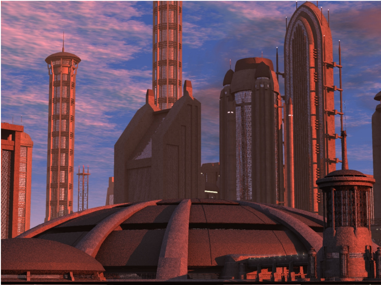
The research complex of the Human Council; in Questions System, 1500 Imperial. Dominating this scene is the Hall of Humanity, where delegates of the Four Emperors attempt to reconcile their competing visions, for the greater good of all men in the sector. This graphic is titled "Dusk 3000" © Antony Ward. Visit his gallery at http://stonedhedge.deviantart.com/