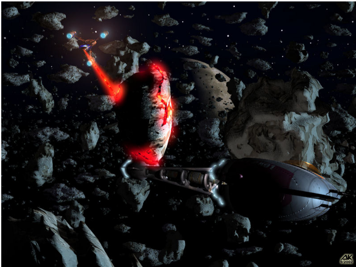
Suedzuk mining craft, Athuerr system, 698 Imperial

The graphic is titled "Asteroids I" ©Alexander Kröner.