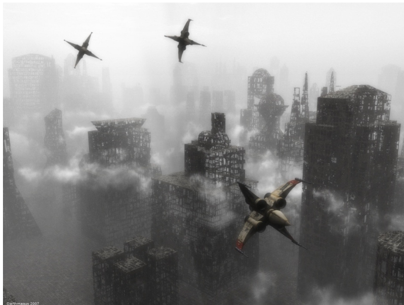
Blood Vargr fighters, conducting reconnaissance over a destroyed city on Black Pearl, c. -1765

The 'Blood Vargr' – the local Anglic term for the Suedzuk with their infamous coats of red fur – had undisputed authority, and make up the solid majority of the Vargr population until roughly a century ago, with only a few 'fake Vilani' Ovaghoun and 'cutie-pie' Irilitok Vargr interspersed in the general population. The Blood Vargr are infamous for the destruction of the garden world of Gashikan, the homeworld of a minor human race called the Yileans, in A.D. 2862 (-1658 Imperial). However, in A.D. 3093 (-1427 Imperial) the Vargr were effectively exterminated within Gashikan Sector by the Yileans' Wolvesbane Project. The Project, an anti-canine plague, was successfully quarantined within the sector by the Vargr, but only at great cost.