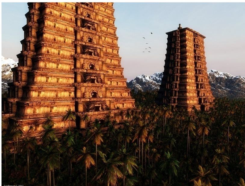
Legion of Breskain temples to the God of Man, on Pramas, 372 Imperial.

The Black'n'Reds position as honest brokers and disinterested outsiders 'with only the universal needs of all humaniti in mind' provided a foundation of trust between them and the largely mixed Vilani locals. This impartiality before Vilani & Solomani was actually genuine: the Yileans find both major human races admirable, for different reasons. For their part, the local human insurgents were also dazzled by the Yilean mystique: as of 364, the distant, tightly organized Second Empire of Gashikan has been ruling over a thousand systems for 2,000 years, utterly exterminating the Vargr within their extensive borders.