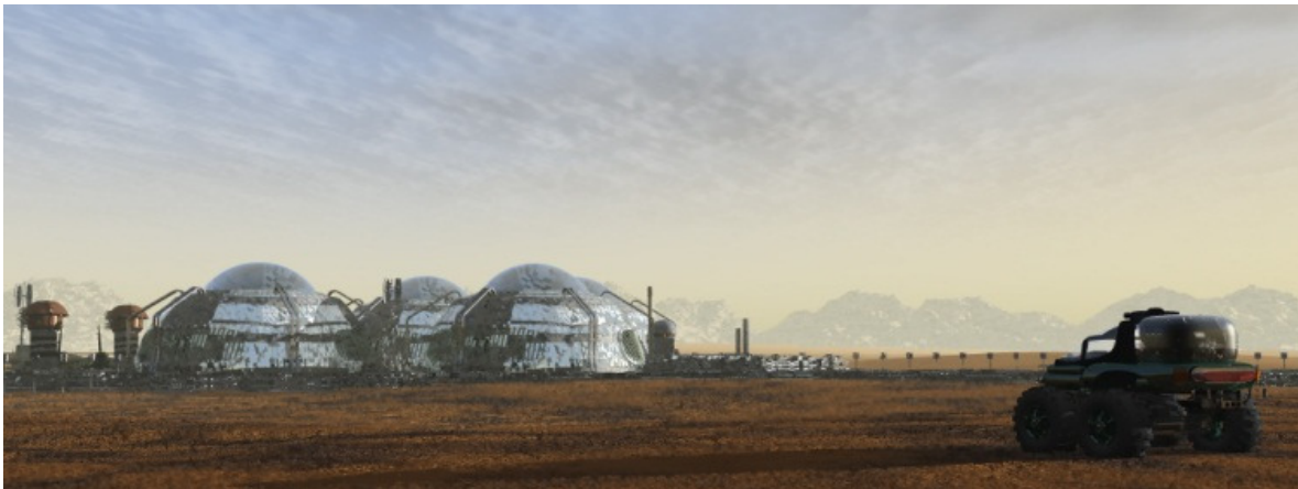
A Vargr farm on Kharo, 990 Imperial. While the atmosphere is being reformed, it will take another half-millennium before it can be reliably breathed safely by Vargr (and humans).

The further disintegration of the Hegemony was stopped only by the suicide of the Hegemon in 307-872, and the decision of his successor to immediately lift all economic restrictions and austerity measures while renouncing all war debts. The hyper-inflated currency was dumped, and privately-held currencies were permitted to take its place; precious metals, rare earths (including lanthanum, used for starship jump grids), the Imperial Credit, and the Julian Star were also authorized for use as currency. This had the effect of salvaging the economy while destroying every major banking establishment, every financial house, and most family fortunes within the Hegemony.