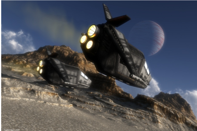
Hegemony forces on deployment, Tsoe system, 940 Imperial

markets. There are increasing tensions between the old heart of the Hegemony in Mycocona/Arzul and the new capital in Lorean/Amdukan, which needs to be addressed. Several worlds in Beta Quadrant are hot-spots of anti-Hegemony hostility: the locals don't have the muscle to secede and make it stick, but they can and do make it a pain to run the place.