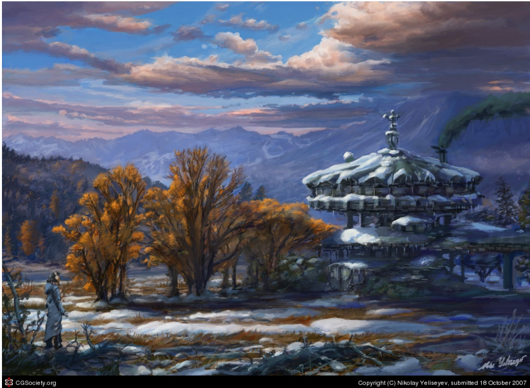
Former residence of Morth Sawng on Ssilnthis, 480 Imperial.