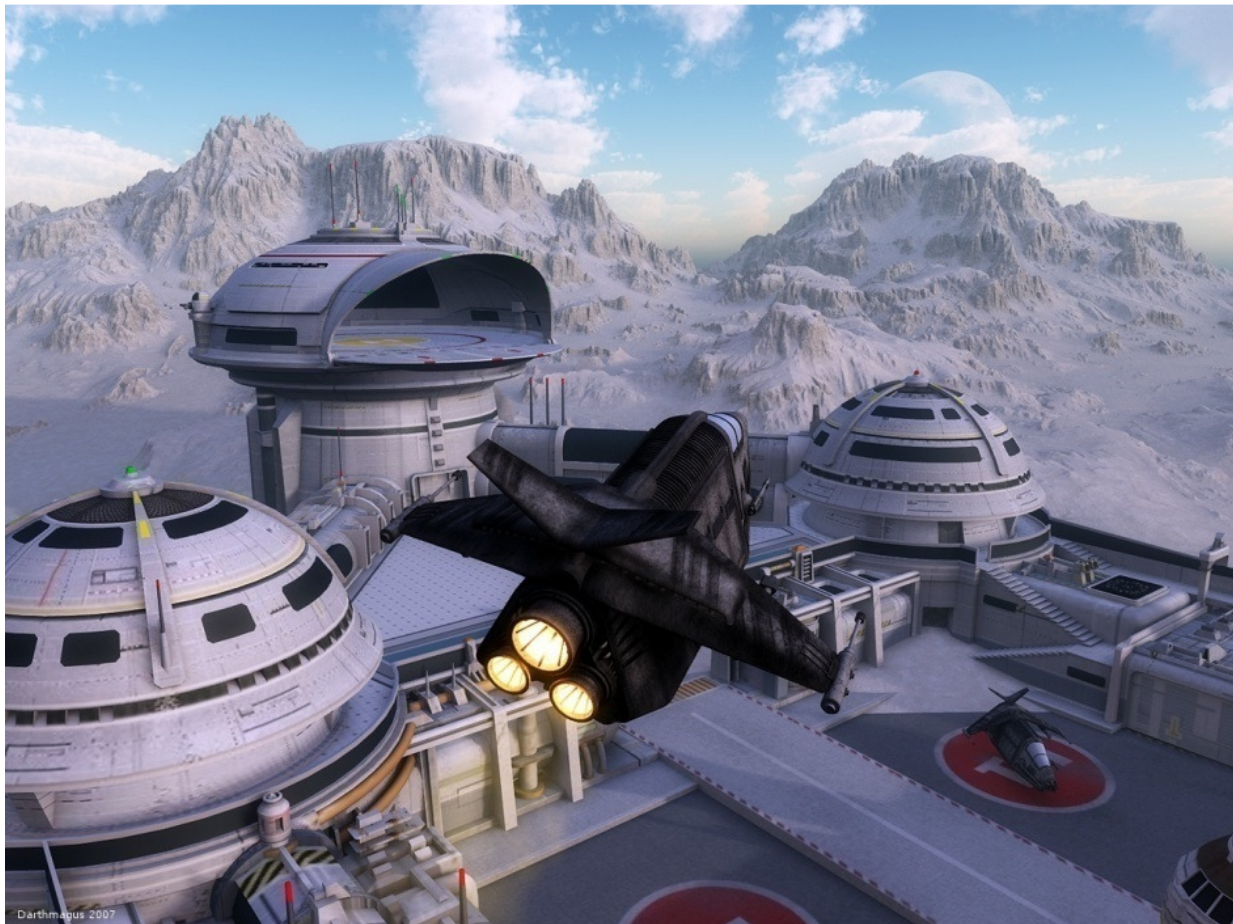
Hegemony supply & logistics station, Tsooe system, 940 Imperial

The graphic is titled "Uzuz" © Philippe Bullot.