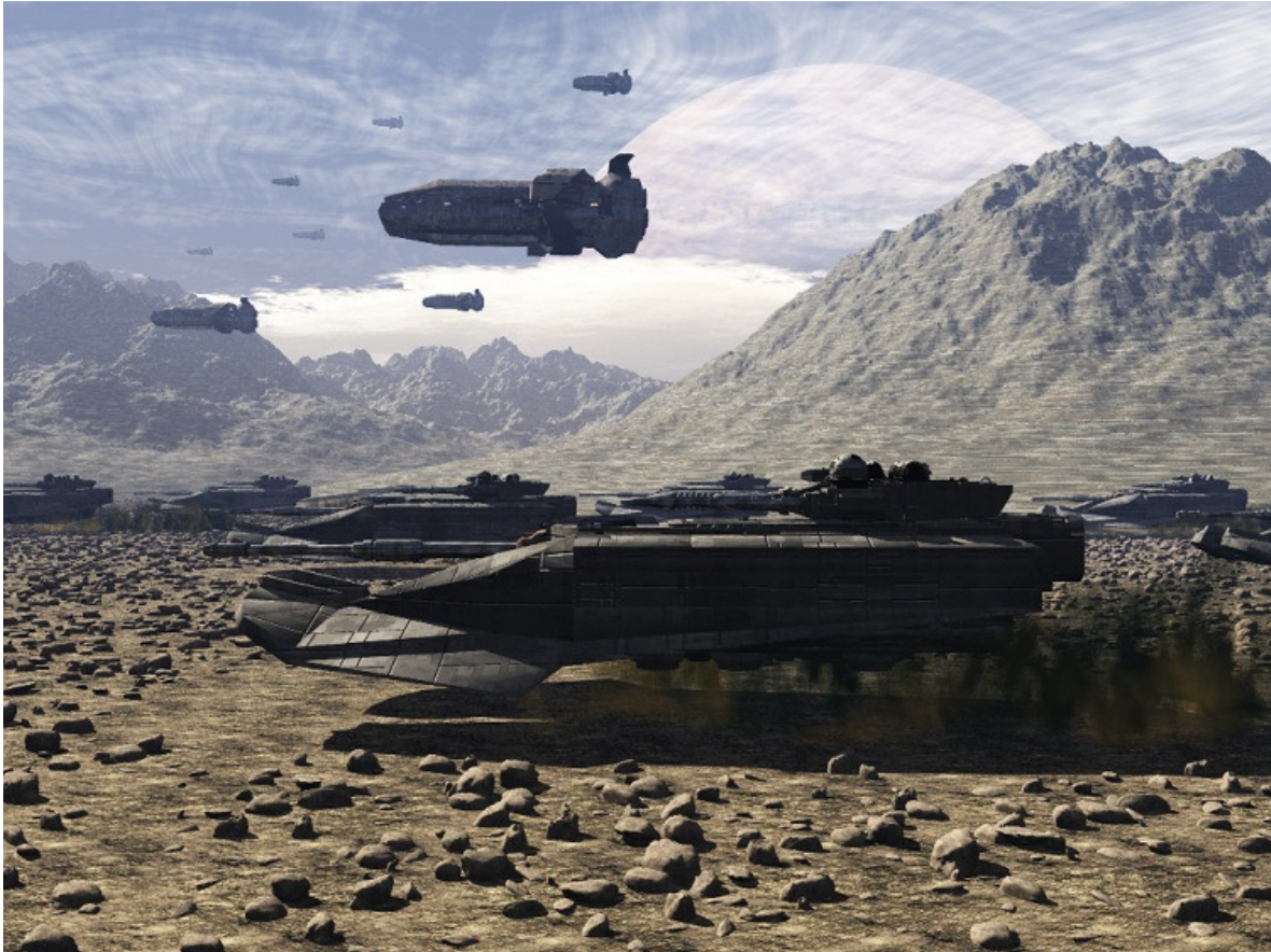
The invasion of Osaer, 634 Imperial. This graphic is titled Gravics Ground Assault Division # -*3_1 © Glenn. See his work at http://www.renderosity.com/mod/gallery/index.php?image_id=1539538

dissolve the Kingdom. With the end of the Kingdom, the human and Ikonaz-style Vargr/Vilani corporations of the BloodUnion were able to dominate interstellar trade in both Cotan and Flange subsectors without interference.