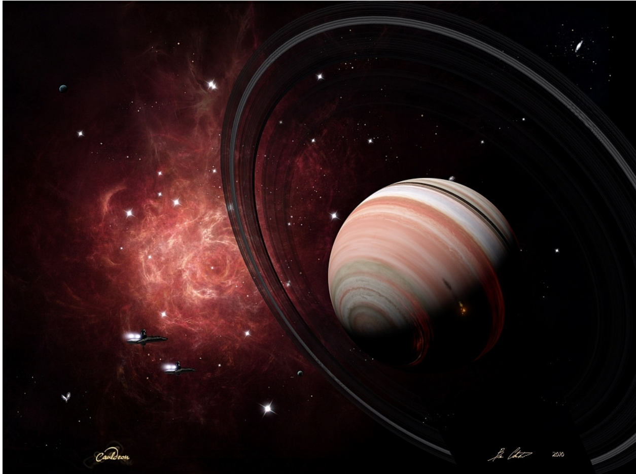
Hegemony freighters approach Kigourzus. Specialized refuelling techniques are required with hot gas giants, to guard against hull failure. Kfueraer system, 993 Imperial. This graphic is titled "Cauldron" © Brian. See his work at http://currentsofspace.blogspot.com/