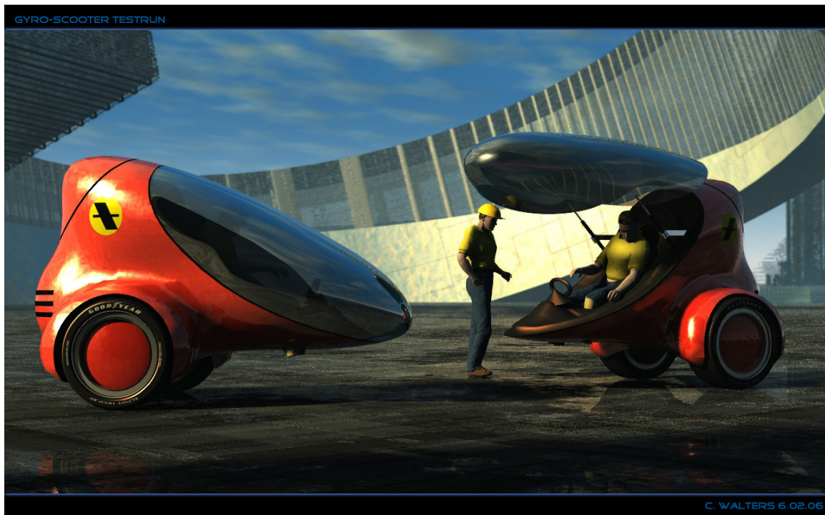
Gyro-scooters, Captain Gita Khanna Starport, Nisaga system, 915 Imperial.

There has also been a revival of a previously abandoned mode of worship, that of Claw Art. This ecstatically violent, extremely ceremonial form of fighting/dancing/chanting has become quite popular among the lower-class Irilitok – despite (or, perhaps, because of) its high fatality rate among practitioners.