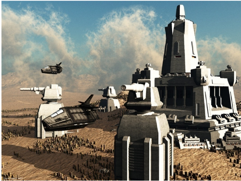
Firestation Sandy-Three, located on Sharleda, 832 Imperial

The graphic is titled "Citadelle Des Sables" ©Philippe Bulot. See his work at http://www.darthmagus.com/images/slides/CitadelleDesSables-4.html