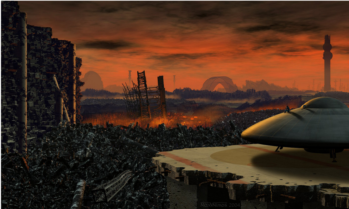
A Saisung Galactic Survey ship observes the ruins of the Ylothi Megapolis, Tsosoe, c. 642 Imperial. At the time, Saisung (a notable world of Azrul sector, hex 0735) was a contender for leadership of the region, and the centre of her own pocket empire and interstellar trading network.

The graphic is titled “Another Lost Paradise”, © Max V. Nimos. See his work at http://www.renderosity.com/mod/gallery/index.php?image_id=825184