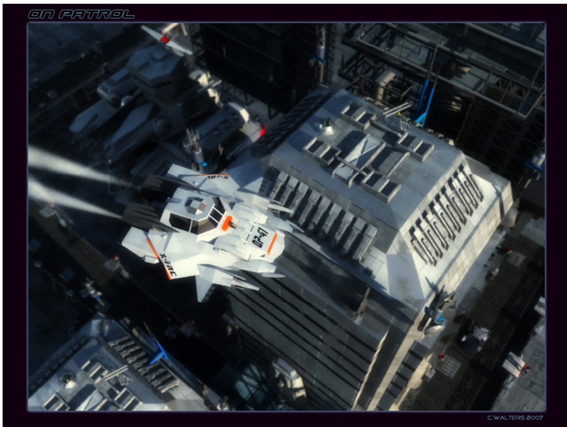
An anti-raider patrol craft over Pamushgar, c. A.D. 2770 ( c. -1750 Imperial). Her numerous and highly effective Trak dual-environment fighters, pictured above, were a key element in her successful defence against the Vargr assault.

Sibikliir and her ‘twin’ Gimushi successfully repulsed two ground invasions (A.D. 2790, 2807 or -1730, -1713 Imperial), but at great cost. The Vargr leadership knew that they would never truly own the sector unless they took down the Twins of Heaven. Gimushi’s government, never part of the Golden Twelve, was willing to accept Vargr rule: but Sibikliir’s combative population never would kneel to the dogs. Therefore, the hunting and striker packs in the sector concentrated their forces into a single armada, strong enough to quickly take the world, and overawe remaining human resistance within the sector. However, Sibikliir had pushed her industrial capacity to the limit, bankrupting herself to create a large (if cheaply-built) jump-capable fleet, able to defend herself and her sister world of Gimushi. The vague outlines of this building program was known to the Vargr thanks to human informants, but the corsairs, conquistadors and pirate lords underestimated both the scope and the speed of the project.