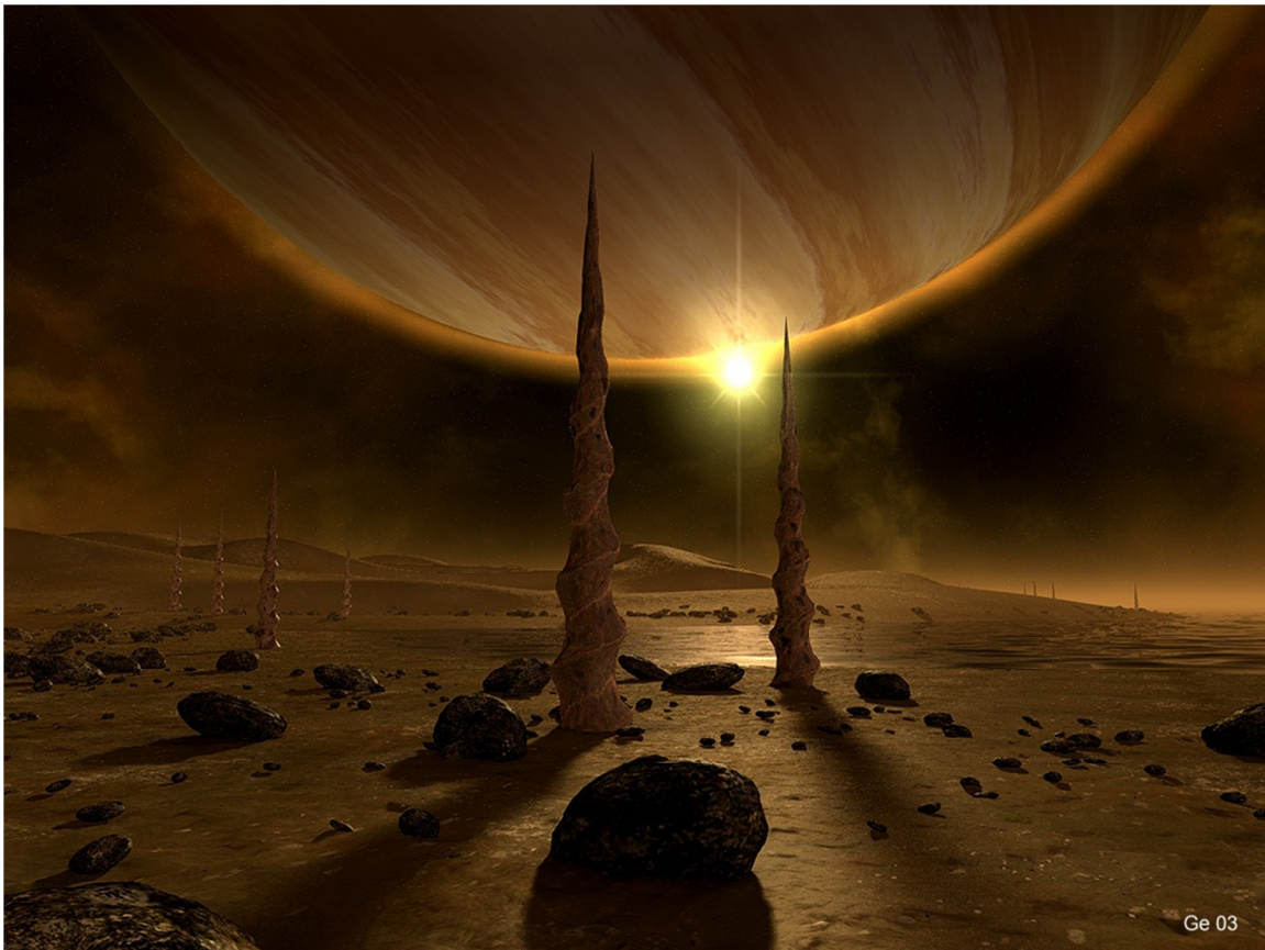
The Monoliths of Thisuel. Thisuel system, 914 Imperial

The graphic is titled "Distant Shores IV", © Christopher Gerber. See his work at http://www.renderosity.com/mod/gallery/index.php?image_id=568961