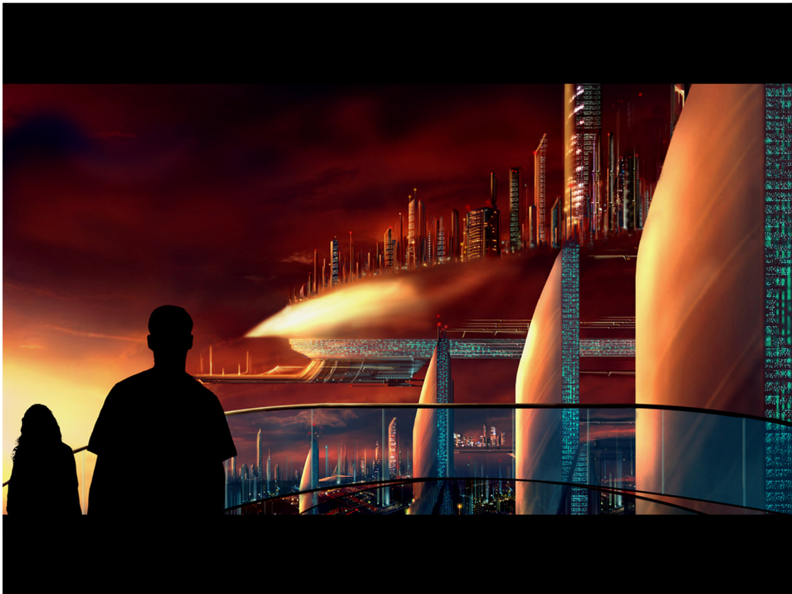
Imperial Nobles on Eshigash/SummerSky, an artigrav city over Ushmigad, 971 Imperial.