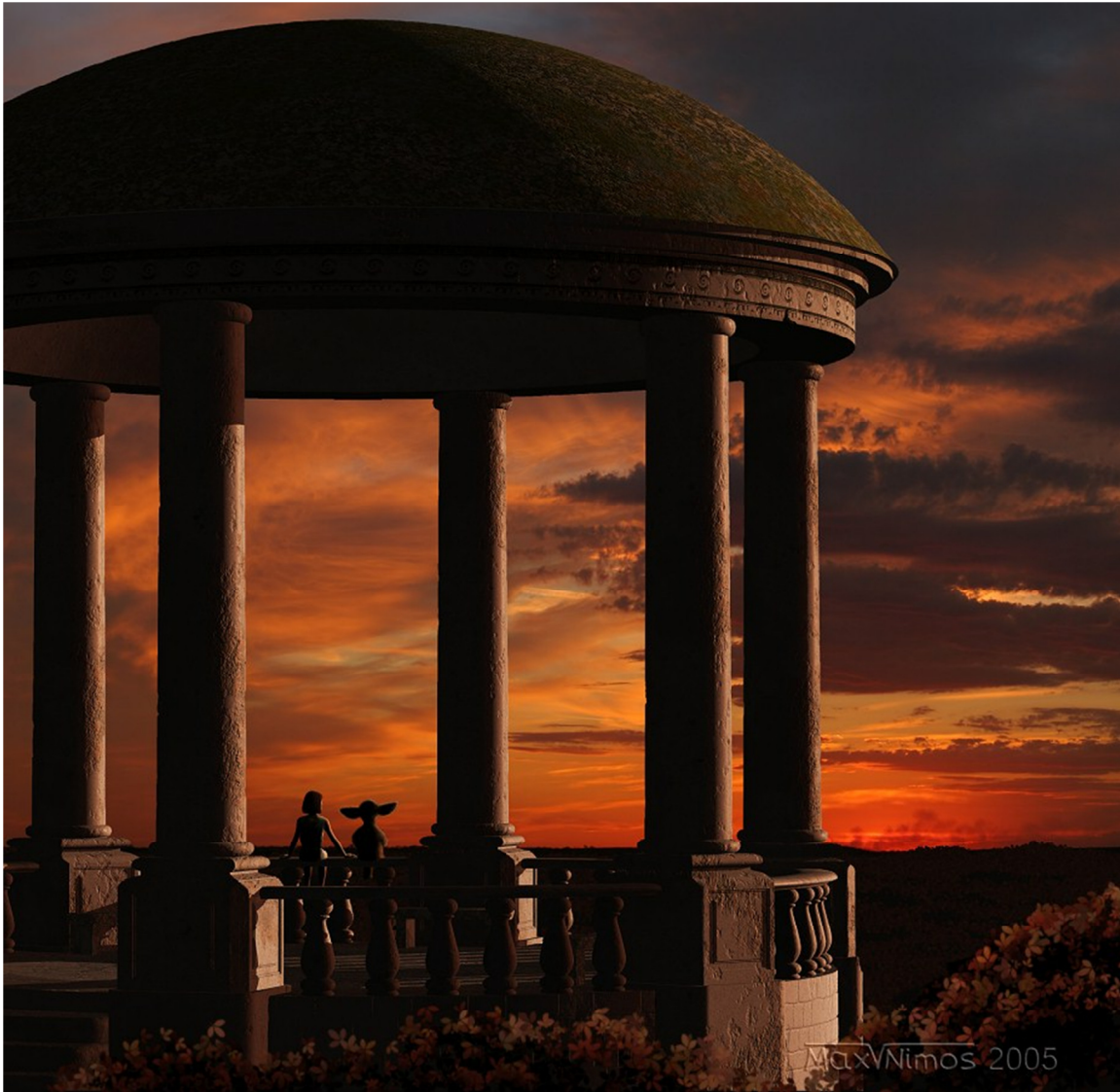
A Solomani girl and her biogeneered pet on Enola, 993 Imperial The graphic is titled "Watching the sunset"