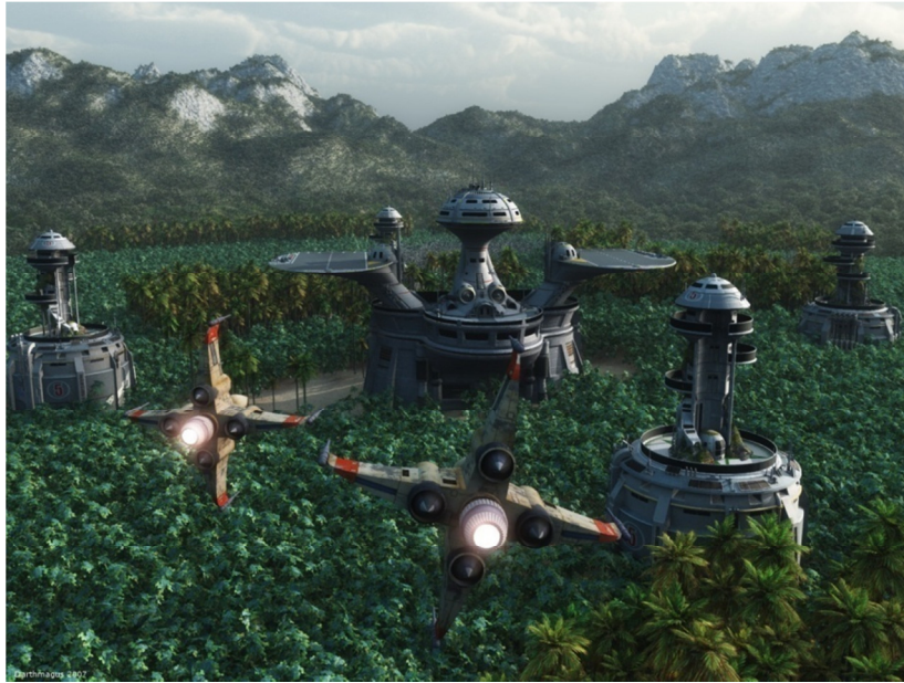
Bwap fortress on Marhaban, protected by 'friendly' Vargr mercenaries. About A.D. 3000 (-1520 Imperial).

serious conflict with the human population, leading to a series of ferocious wars of extermination on numerous minor worlds.