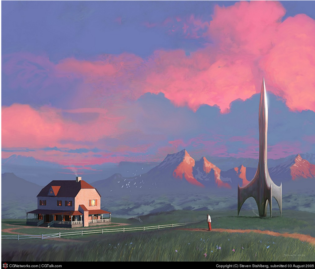
This graphic is titled "Return of the Prodigal Son"