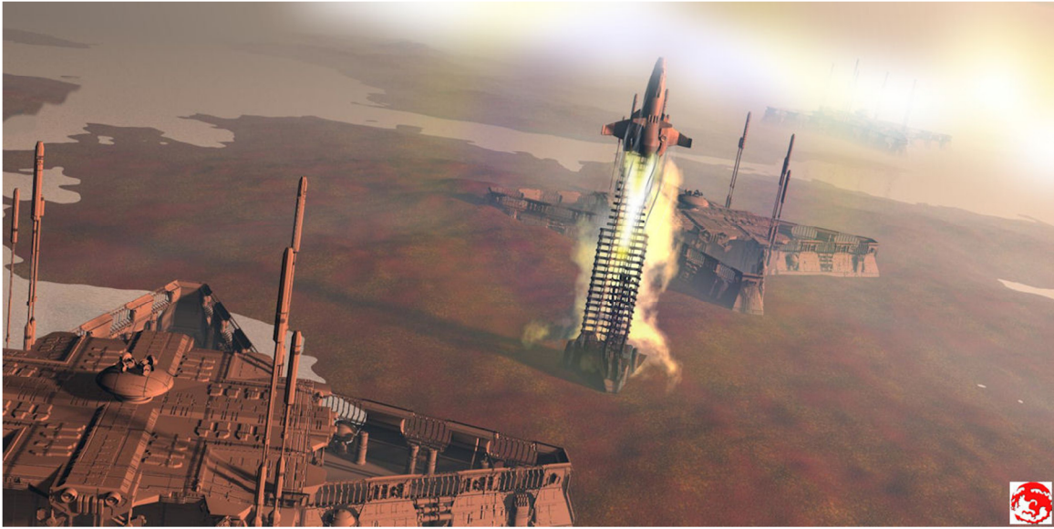
Anemôha settlement, an American Indian colony (Fox-Sauk tribe) on the world of Algonquian (later renamed Belumar). About A.D. 2730 (c. -1790 Imperial)

Bwap Will to Order than anything the Terrans did.