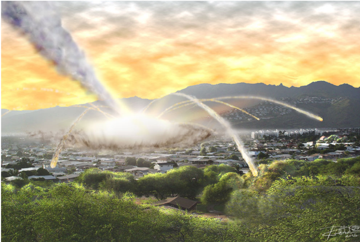
A settlement on Black Pearl (now Saeghvung/Nisaga/Empty Quarter 2618) suffers a Vargr bombardment, c. A.D. 2765 (c. -1765 Imperial).

The graphic is titled "Impact 2", © Ron Lanham. See his work at http://www.renderosity.com/mod/gallery/index.php?image_id=933715