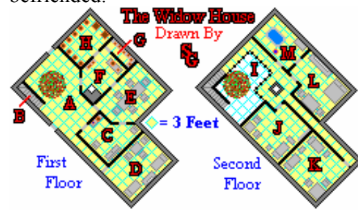
The Widow House First Floor

*The party may discover that Janna's barn houses not only equines, but also spiders that have been charmed by Isella, including another Fey arachnid that she has befriended.