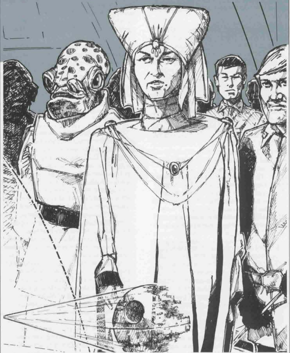
The Battle for Endor from the PCs' Perspective

Star Wars is ®, ™ & © 1993 Lucasfilms, Ltd. (LFL). All Rights Reserved.