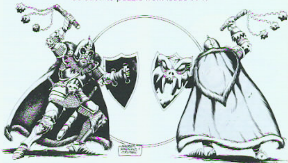
Solution to puzzle from issue #71.