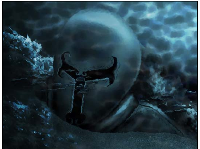
The final fate of Talos the Triple Golem beneath the waves?

Long lost, it is now whispered that the treacherous drow clerics beneath the Hellfurnaces seek to recover the staff to gain favour with their dark queen. It is believed that only a drow high priestess may safely employ the powers of the staff, but the consequences of such employment are unknown (but believed to be dire).