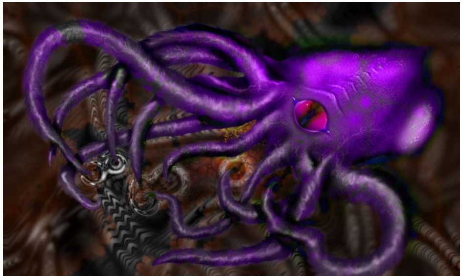
Vilp-akf'cho Rentaq, one of the three Elder Elemental Gods manipulates untoward energies.

Q: In an early Dragon magazine you mention that Mordenkainen lead his cavalry forces to the Far West to succor a friend in need. Who was this friend and what was the result? (Obviously, Mordenkainen ultimately settled in the West, building his Obsidian Citadel in the Yatils.)