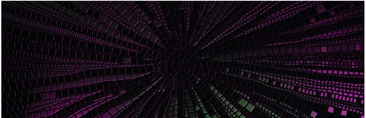
Erie purple and green light illuminate a mosaic of a black sun with variegated rays. This greets intruders of the high priests’ crypt in the Lost Temple of Tharizdun.

Q: Is there any relationship between The Temple of Elemental Evil (ToEE) and the Elder Elemental God? (T1-4 indicates no relation whatsoever, but according to your above comment on the Eye of Fire symbol, it appears she was blatantly using the EEG’s symbol, or a parody of it, as part of her ruse-religion to draw evil beings into her service.)