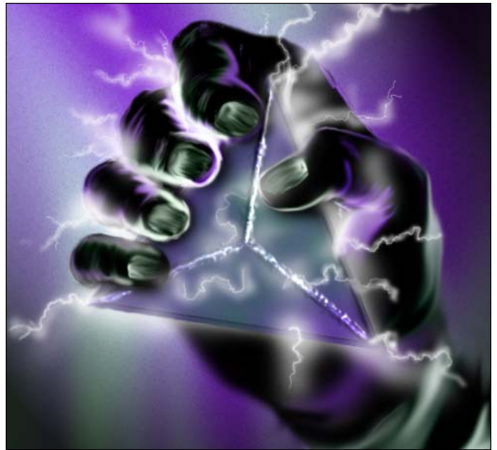
A follower of the Elder Elemental God invokes its name via his unholy symbol.