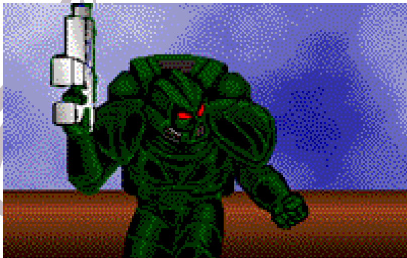
Illustration by Aaron Barlow & Martin Rait

The Bulldog is a typical attempt at creating a heavy powered armour at moderate tech levels. Although it's specifications mean it would be highly effective, the power sources available mean it's duration is severely limited.