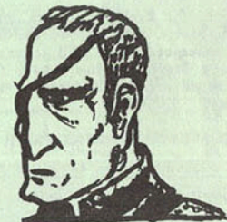
THE CARAVEL'S CREW

Captain Aldwyn orders women, children, and oldsters below. He issues weapons to his small crew and asks your assistance. What choice do you really have?