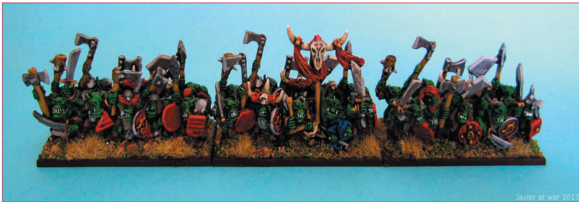
Javier at war 2013