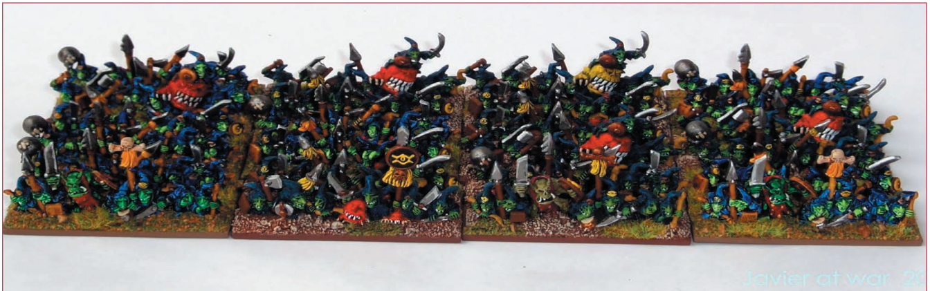
Javier at war 2013