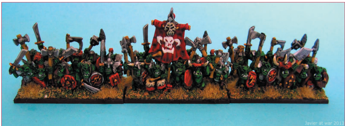
Javier at war 2013