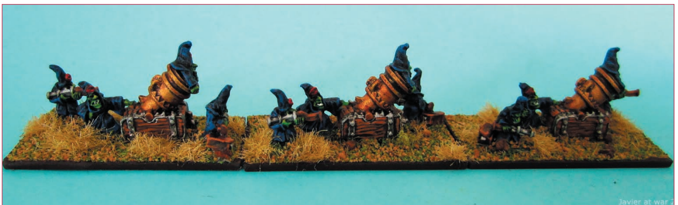
Javier at war 2013