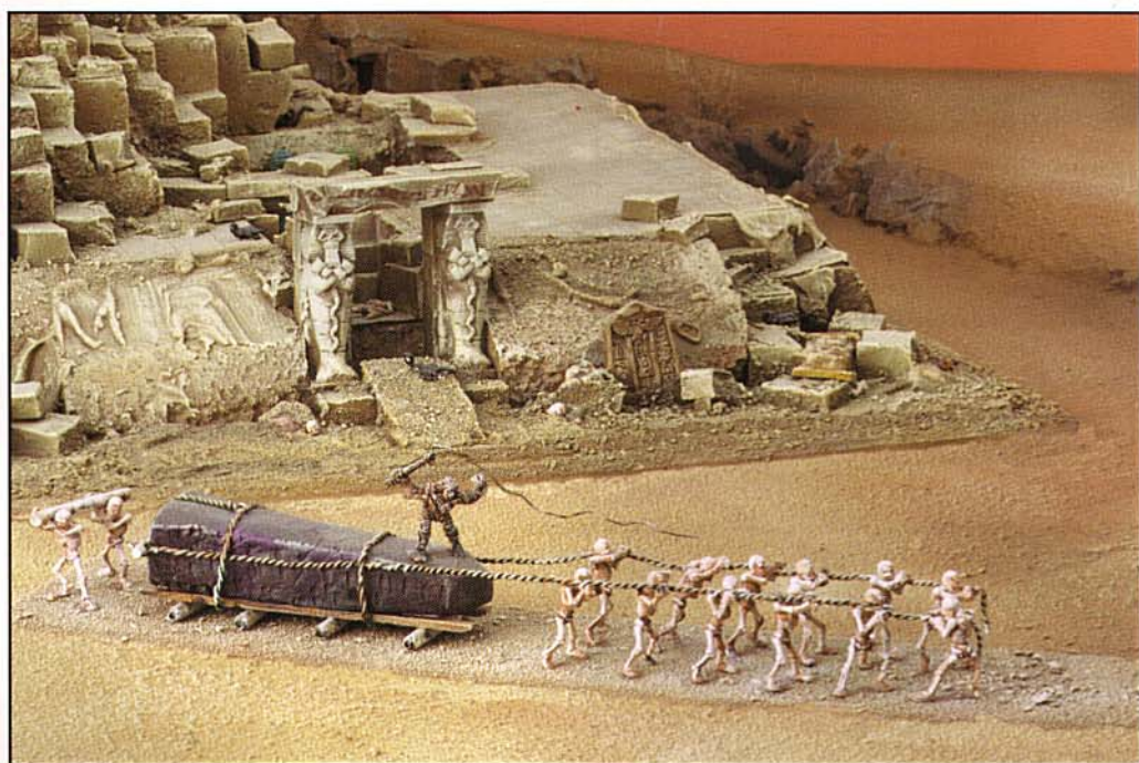
A Tomb Prince 'encourages' his Undead servants in moving a huge monolith.