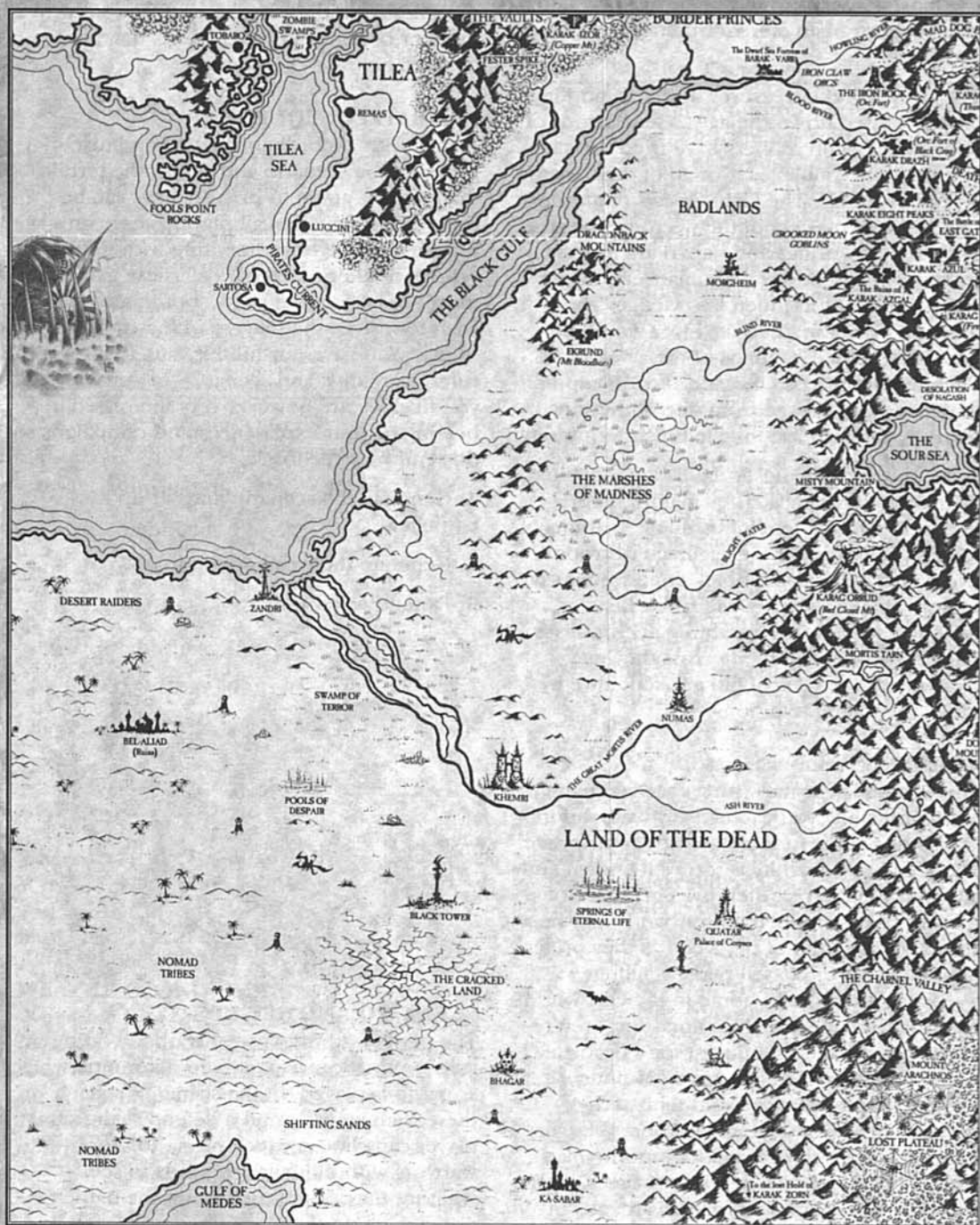
Map of the Ancient land of Nehekbara scribed by the Arabian scholar and cartographer Kashaff Wallayaf.