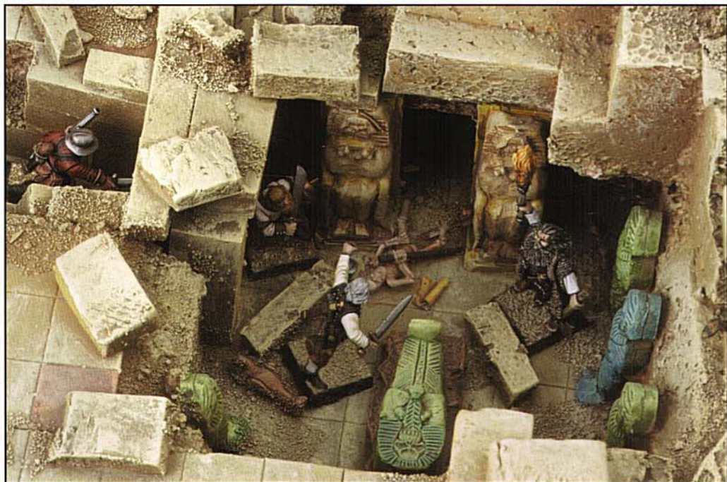
Tomb robbers from the Old World prepare to desecrate the burial chamber of a Khemrian Necropolis.

Read all about the new Khemri alternate setting on pages 3-12 of this magazine.