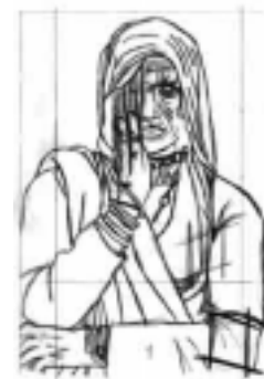
Two sketches of pictures from Chart of Darkness .