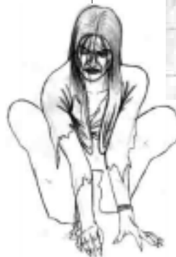
Choul, also from issue 10.