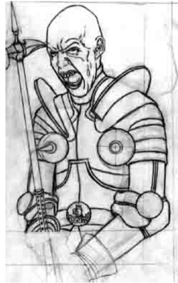
Cleric of Morr from Corrupting Influence .