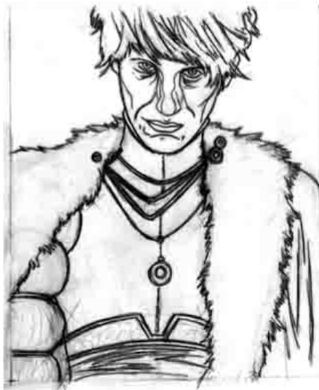
Two more necromancers. The one on the left was on the cover of issue 10 and one of the most popular. Note the symbol sketches to left of figure. These are for the brooch at the front. The figure above is from issue 15.