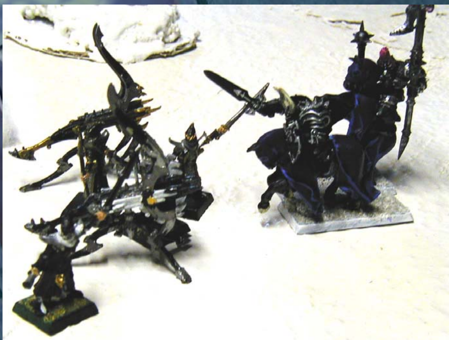
The last lone Chaos Knight charges down the Reaper Bolt Thrower in a futile attempt to gain some much needed VPs.

It was amazing that I even pulled off a minor loss. Thinking about it, I think we forgot to calculate table quarters, but I also forgot to use the soft cover from the snowdrifts and so it all works out. The knight surviving helped my victory points. I hate the snow - this could've all worked differently if I hadn't rolled double 1's and ended my 3rd turn; I might have gotten a draw. Next game I will play with more knights and nothing as slow as marauders, this was fun and we must play another game for a battle report.