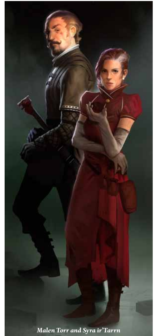
Malen Torr and Syra ir'Tarrn

Malen Torr uses his position in the embassy as a shield, behind which he acts in what he considers the best interests of his nation. He respects Ambassador ir'Tarrn's diplomatic prowess, but he knows she has no stomach for espionage and shadow work, and so he does not involve her in such activities. He also knows that the ambassador is lonely, and this loneliness made her vulnerable to Kelani Thauram's charms. If Kelani hadn't been the daughter of a