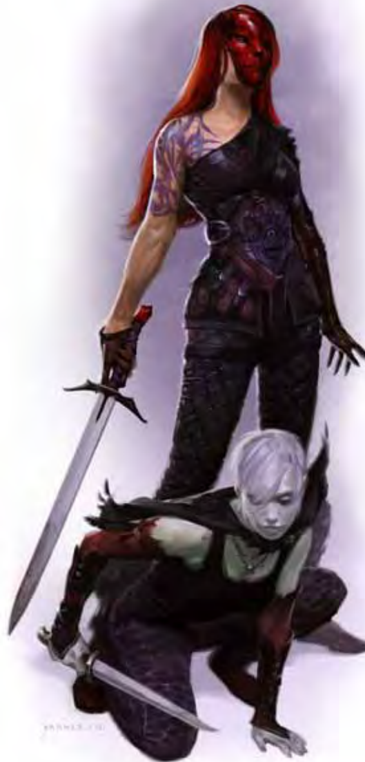
Thora Tarkanan and Simile

Thora and her followers fight to the death. The sound of combat in this area alerts Drago and his war-forged guards in the shrine chamber, who prepare an ambush for the adventurers. See area 6D.