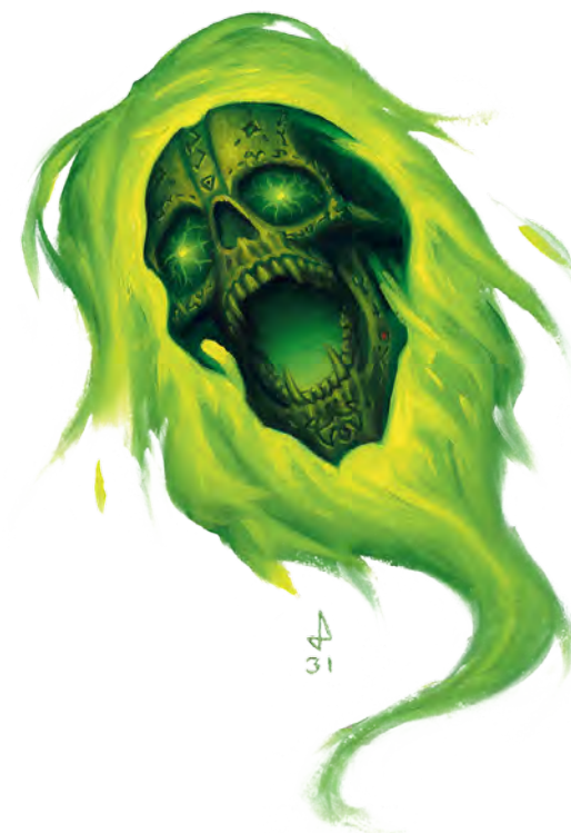
Eldreth Zanderraum, flameskull

Lanador receives shipments of supplies from a boat that navigates the underground river a couple of times a month. He's also awaiting the arrival of a boat carrying a drow interested in buying elf slaves from him (see "Concluding the Adventure").