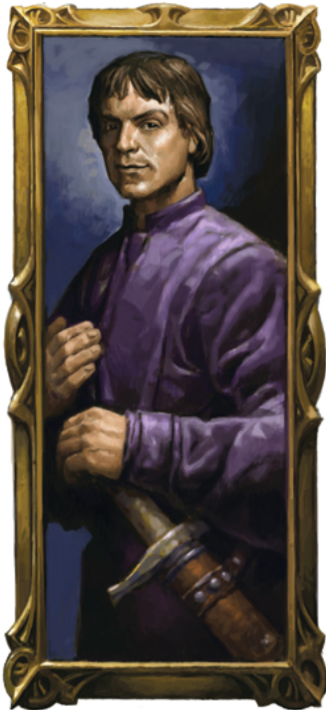
Lord Elevur Tarm

Word has spread across the City of Splendors of what transpired at a revel hosted by a noble lord of Waterdeep. A guest in a back room was seen talking to a painting of a long-dead noble—and the painting answered him! Old rumors have been revived that describe how a dragon that is trapped in a painting can be compelled to answer a question put to it by someone who touches the canvas and utters a word that appears somewhere in the painted scene. The wyrm, 'tis said, answers truthfully but seeks to manipulate its questioners to procure and assemble certain items. Perhaps these items can free the dragon from the painting, or perhaps they are needed to further a darker purpose.