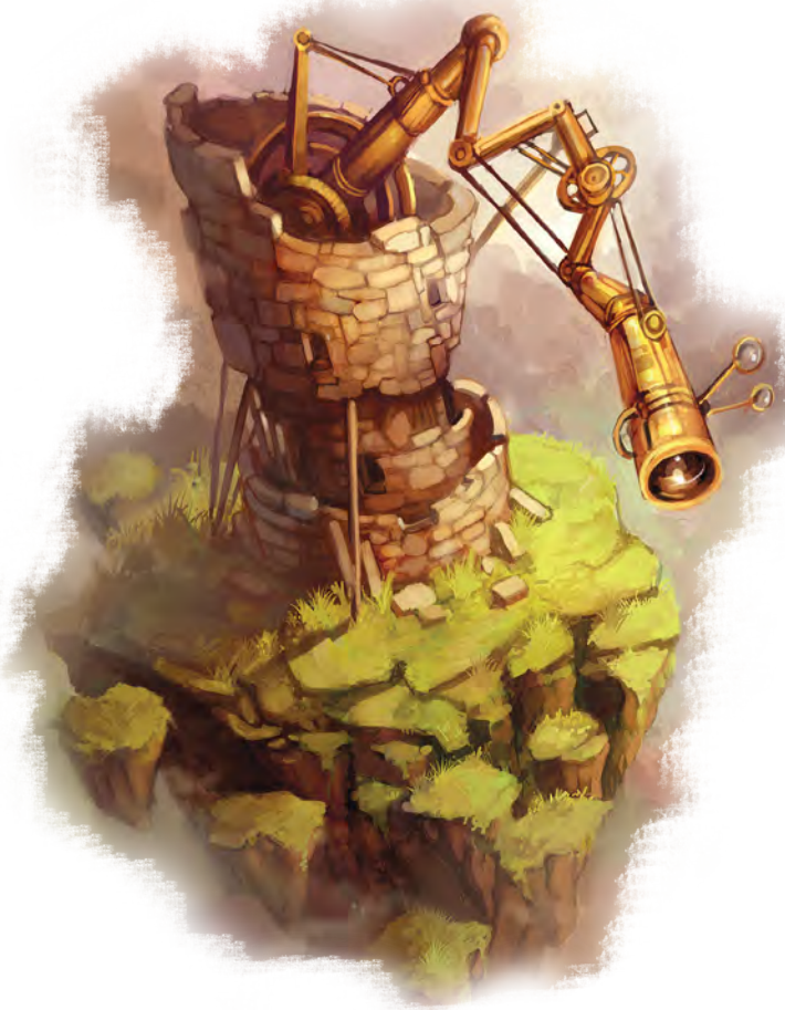
Illustration by Julie Dillon

About a year ago, I had a half-baked idea for an adventure set in the planar city of Sigil. The adventure, titled “Broken Ring,” would open with one-fifth of the ring-shaped city being obliterated, and floating amid the wreckage would be the Gatehouse—the city’s insane asylum. How it survived and who caused the explosion would be the mysteries the PCs had to solve. The Bleak Cabal (nihilistic keepers of the asylum) would surely take credit, but I envisioned the true culprit being one of the asylum’s deranged prisoners, whose deep contemplation of the mysteries of the multiverse led to a philosophical truth so profound in its implications that the thought alone caused the catastrophe. It’s a crazy notion, to be sure, but very much in keeping with the core themes of the PLANESCAPE® setting.