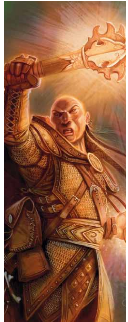
A human cleric channels the power of his god

As with dwarves, human societies typically support large and well-organized temples, religious orders, faiths, and divine traditions. In fact, many of these traditions and faiths share their place only with difficulty—religious rivalries and competition for influence over important affairs is commonplace