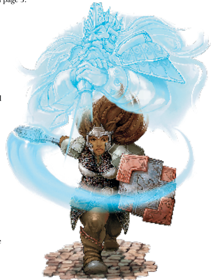
Dwarf cleric of Moradin

You can choose any powers you like, but if you are a battle templar, it's a good idea to choose powers that use Strength attacks; priest's shield and righteous brand are your best at-will choices, while healing strike and wrathful thunder are good encounter power choices for you. If you're a devoted templar, you'll find powers that feature Wisdom to be better for you. Lance of faith and sacred flame are at-will powers relying on Wisdom, and cause fear and divine glow are good choices for your encounter power. If you have good scores in both Strength and Wisdom, it's a sound idea to choose a mix of melee and close or ranged attacks so that you always have a power at hand for the tactical situation.