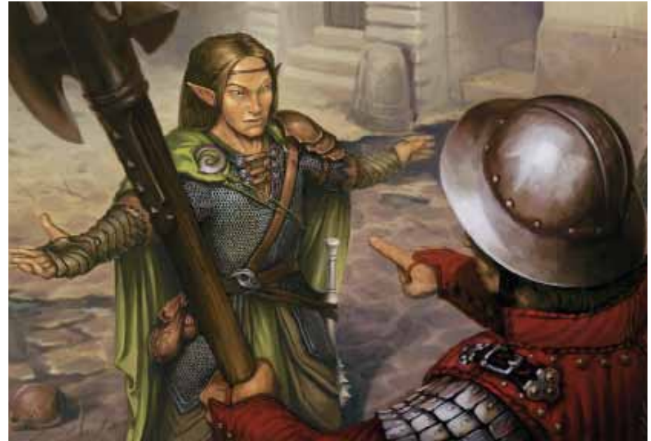
A city guard unwisely challenges a cleric of Melora

Astral Defenders This prayer conjures two ephemeral warriors to guard you in battle. They might appear as silver-armored knights or winged angels, but regardless of their form, they pose a keen threat to your foes. Enemies that move past them or ignore their presence provoke opportunity attacks from the defenders' radiant swords.