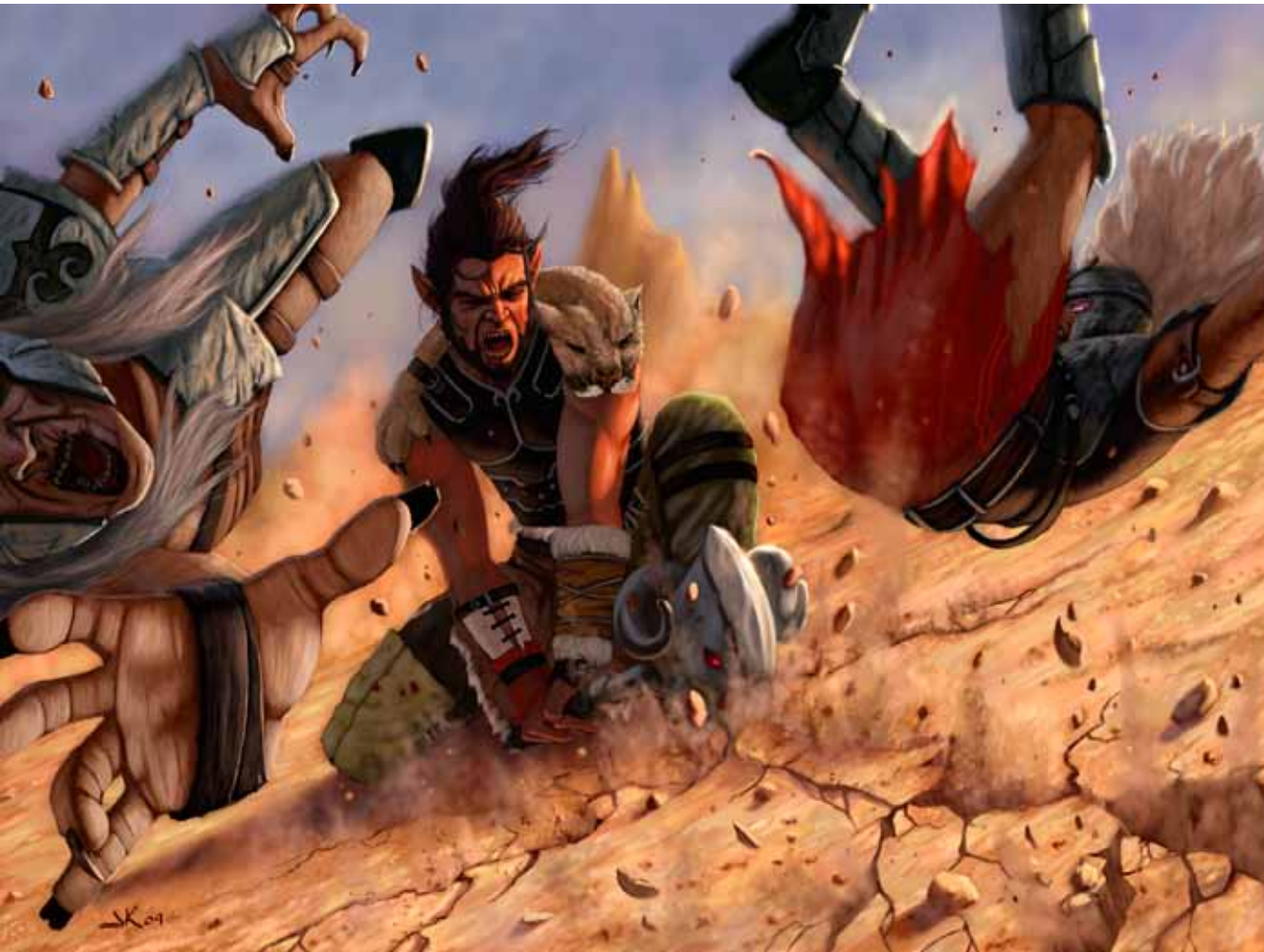
Illustration by Jeffrey Koch

The pulse quickens. Breath comes fast and heavy. Vision sharpens. The body reacts before the mind comprehends. In the long moments of the chase, hunter and hunted share the same spirit. No matter how learned or civil, both become beasts. But one mouth slavers while the other becomes dry. Both run toward life, but at chase's end, only one still breathes.