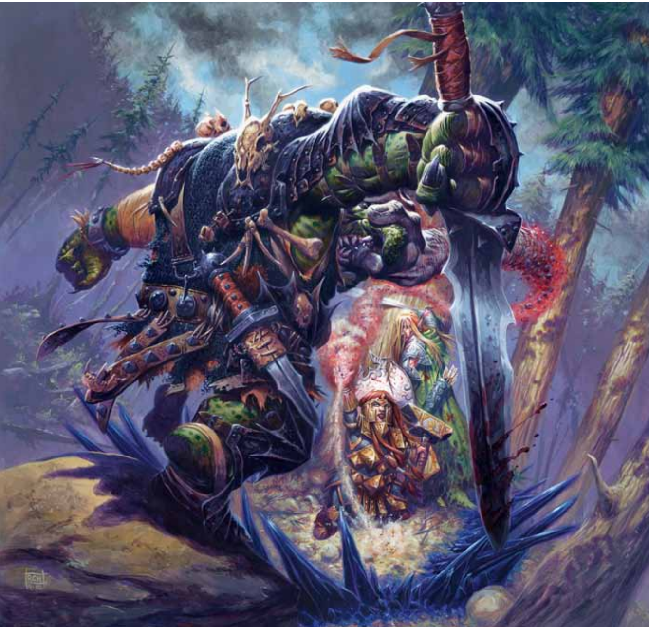
Illustration by Ralph Horsley

The lords of the earth preach patience, endurance, and fortitude in the face of overwhelming odds. Your duty is to be like the rock of the earth to your allies and community, a reliable source of support and strength. While others crumble in despair, you stand tall, strong, and resolute. In so doing, you bring out the best in your allies.