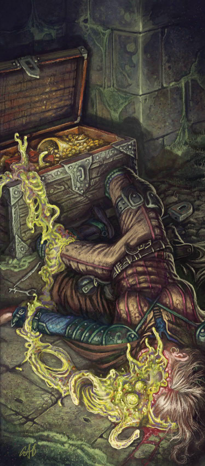
Illustration by Christopher Burdett

The old sage looked up sharply. “What’s that? You’ve not tried to open it, I trust? Beware lone abandoned chests in cellars of this city. They’re all too often left behind for a reason. What waits inside could turn you to jelly—or worse.”