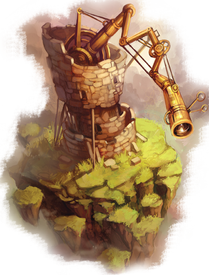
Illustration by Julie Dillon

About a year ago, I had a half-baked idea for an adventure set in the planar city of Sigil. The adventure, titled “Broken Ring,” would open with one-fifth of the ring-shaped city being obliterated, and floating amid the wreckage would be the Gatehouse—the city’s insane asylum. How it survived and who caused the explosion would be the mysteries the PCs had to solve. The Bleak Cabal (nihilistic keepers of the asylum) would surely take credit, but I envisioned the true culprit being one of the asylum’s deranged prisoners, whose deep contemplation of the mysteries of the multiverse led to a philosophical truth so profound in its implications that the thought alone caused the catastrophe. It’s a crazy notion, to be sure, but very much in keeping with the core themes of the PLANESCAPE® setting.