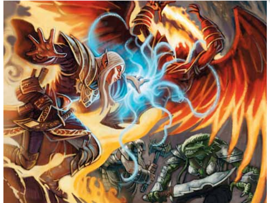
The eladrin wizard assails an angel of valor with a sudden blast of cold

Otiluke's Resilient Sphere Although Otiluke is not as well known as Mordenkainen or Bigby, his contributions to magic cannot be understated. Otiluke's interests focused on spheres, especially those created from force. His most famous spell, perhaps because of its dual applications, is Otiluke's resilient sphere . You can use it to imprison an enemy and thus take it out of the fight, or as a barrier to protect yourself from attacks.