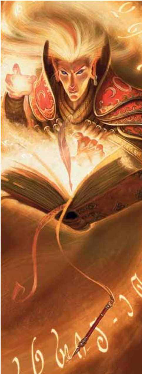
An eladrin wizard studies his spellbook

lessons in exchange for the apprentice's labor. Mixing potions, sweeping floors, and clearing out cobwebs defines many an apprentice's early life. Bit by bit, though, the lessons start to sink in, and the apprentice learns how to control simple cantrips and later more powerful spells.