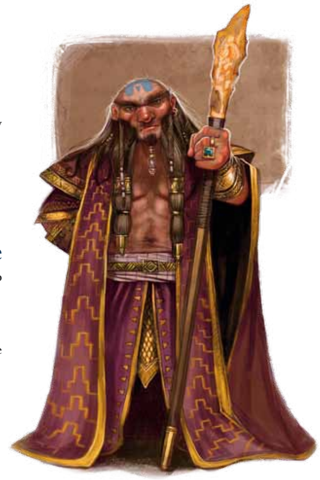
A dwarf wizard

Benefit: You gain a feature associated with your epic destiny.