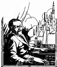
CLARK ASHTON SMITH