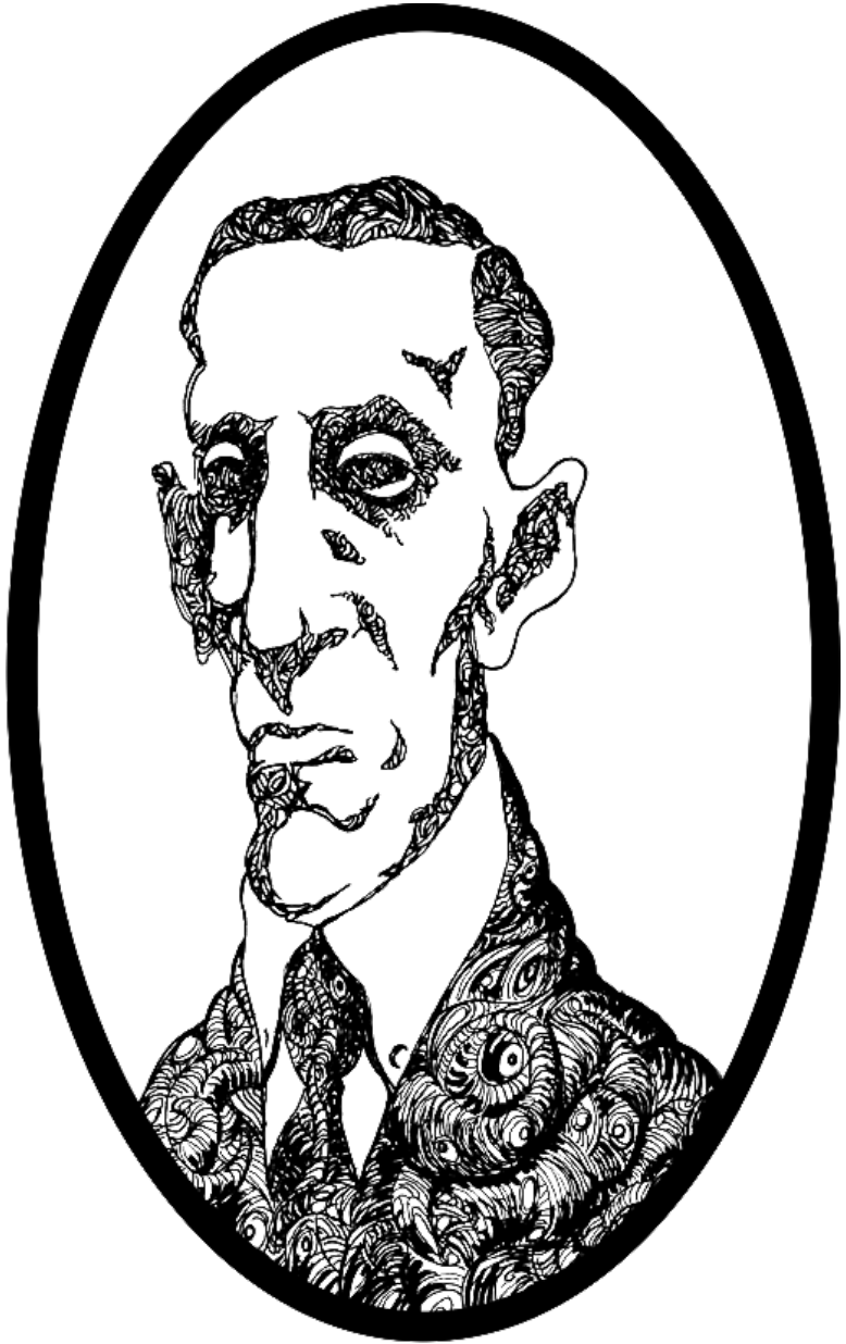
Howard Phillips Lovecraft