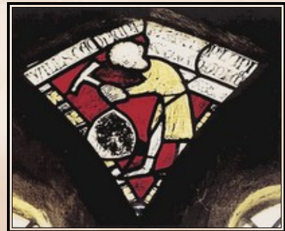
stained glass in temple of Kord

Overview Village: AL LN; 1,200gp limit; Assets 700,000gp; Population 520; Mixed (75% human, 15% half-orc, 5% dwarf, 5% other)