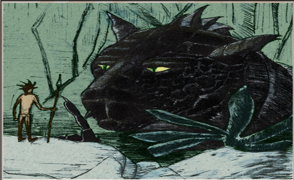
An Onyx dragon gives a passer through a warning...

Reclusive, secretive and unpredictable, Onyx dragons are