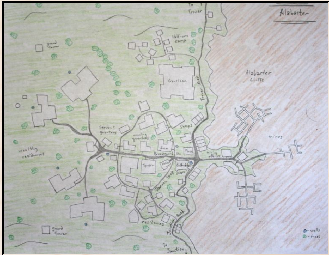
Map of Alabaster