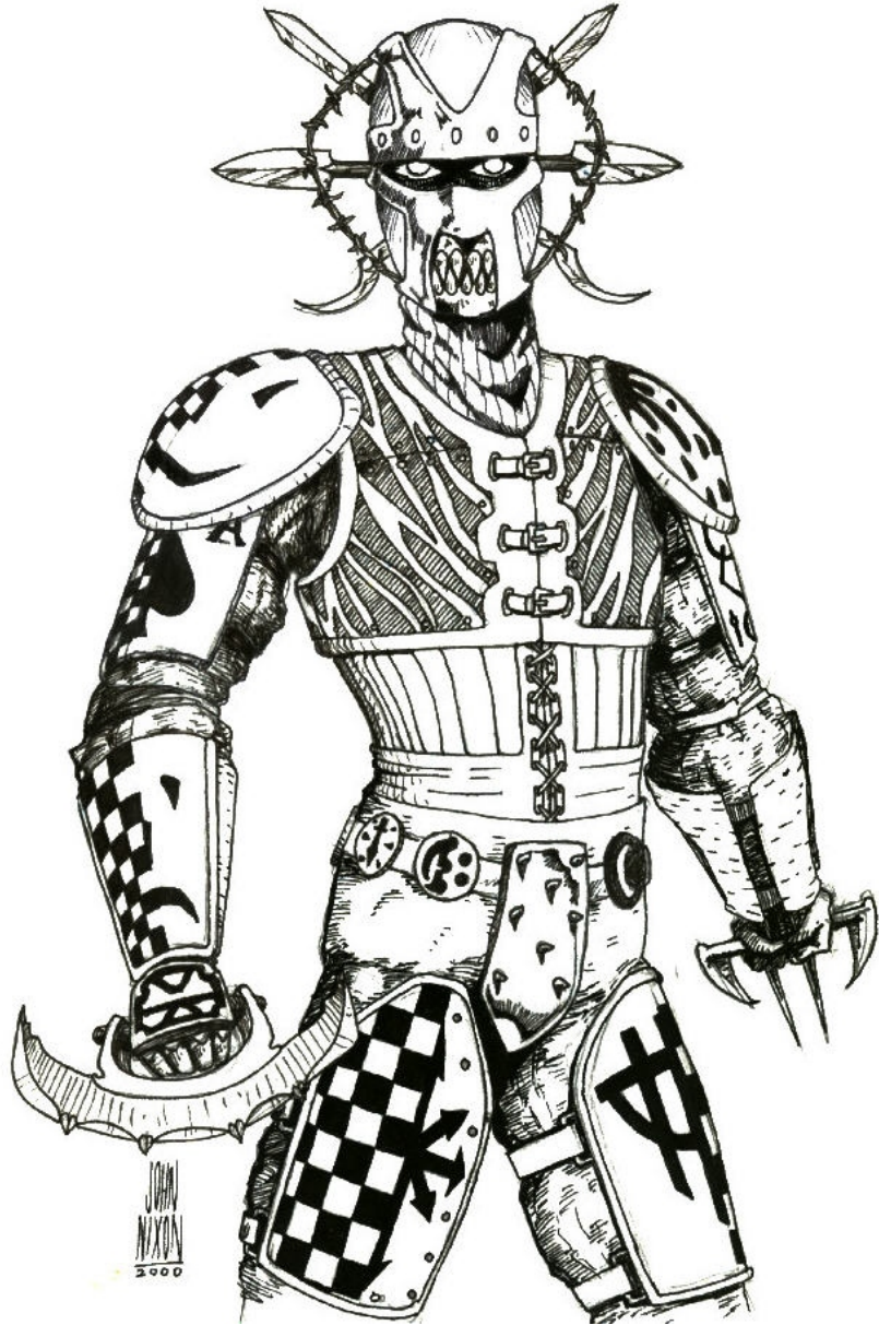
SK2 by Peter Amthor

Initiative Bonus: none Damage Bonus: +8 Damage Capacity (damaged like a vehicle): 6 light damages = 1 medium damage 5 medium damages = 1 heavy damage 3 heavy damages = 1 deadly damage (takes 2 deadly damages before being destroyed) Endurance: 135 Natural Armor: 8 (from metal hull) Powers: Invulnerable to Radioactivity, Telepathy, Telekinesis Attack Modes: Telekinesis, *Pollution, Turbofan (scr 1-2, lw 3-5, sw 6-9, fw 10+) Home: Boeing Scrap Yard A35 Notes: *Pollution rules (as stated in the Lore of Cybertechnology q.v.) POT 1d5 per week, cumulative. Attribute losses are permanent but total (not cumulative) CON=2/3-Weakness, coughing & shortness of breath. Dry feeling on skin CON=1/2-Asthma-like symptoms, mucus. Skin irritation; mosquito-bite like spots and mild rashes appear. (-2 COM and CON) CON=1/3-Serious hacking coughs, symptoms of longtime cigarette smoking and asthma. Most likely bedridden. Skin appears as if badly sunburned with wide rashes. (-5 COM and CON) CON=0-Victims flesh peels and rots. Terrible itching; maggots may breed in the wounds. Bloody hacking coughs; lung cancer; tuberculosis. Death if CON is brought to zero (-10 COM and CON)