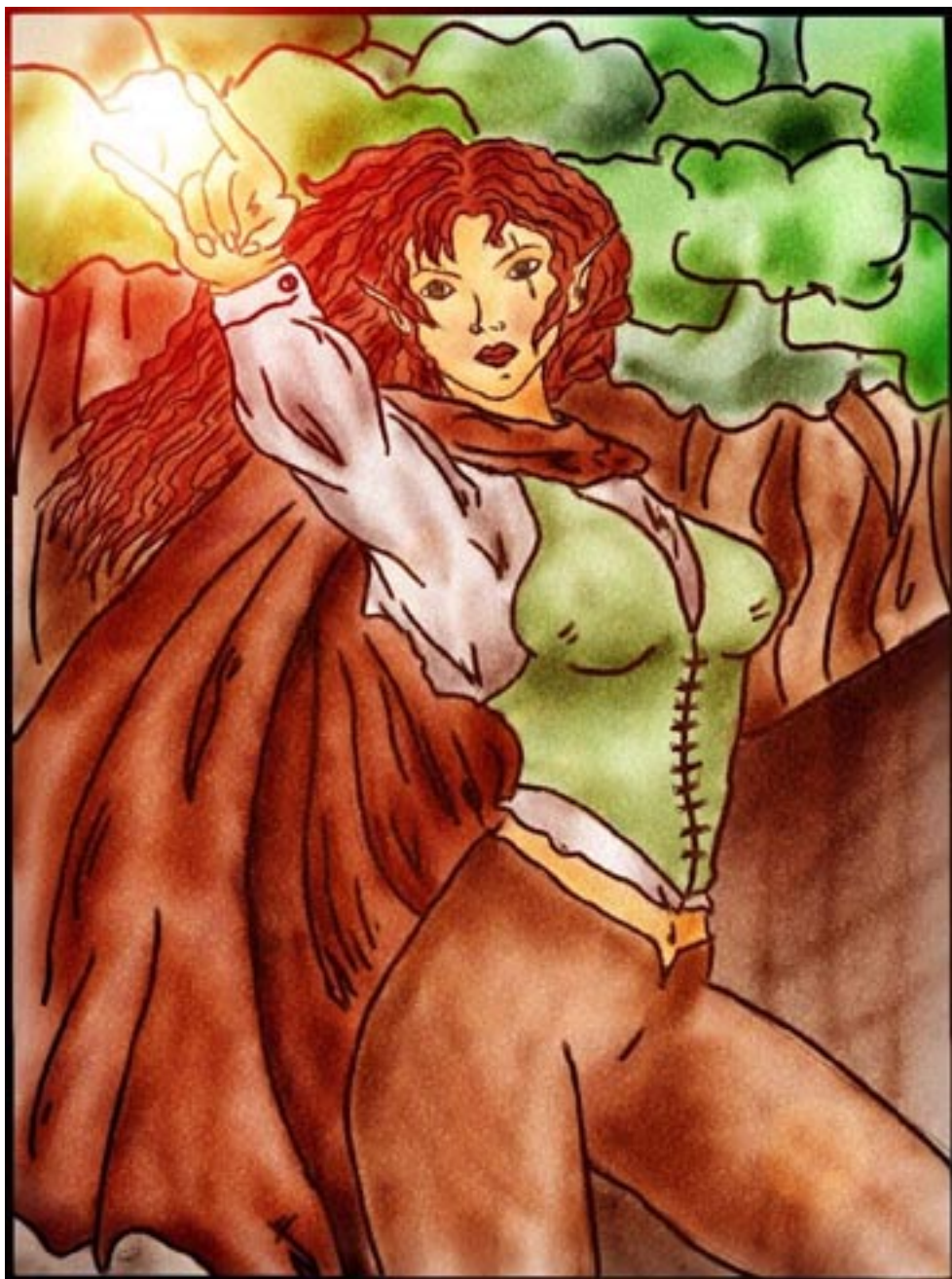
Teliskan Rebensal, dwarf hach'var player

Very taken up with 'running the show', it is he that organizes the impromptu hach'var game. He is very outgoing and domineering, and does not brook any challenge to his authority.