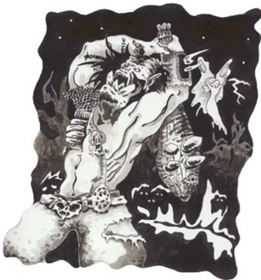
Illustration © Inge Vermeylen

These particular events vary from clan to clan. They often feature strategy