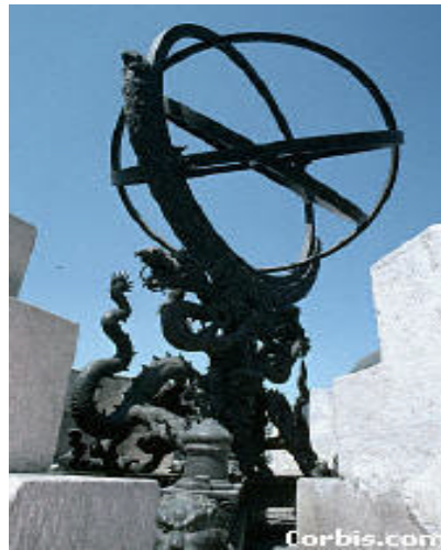
Image 2 - Armillary

months or with two Qin/Porcupine months in the Zhongguo calendar. This is the time of the most inauspicious period as it represents chaos and usurpation of order. Spies and security are put on extra alert during this time to watch for any rebellion. Some said that it was during a doubled Qin/Porcupine month when the Zhou Dynasty overthrew the Quan Dynasty.