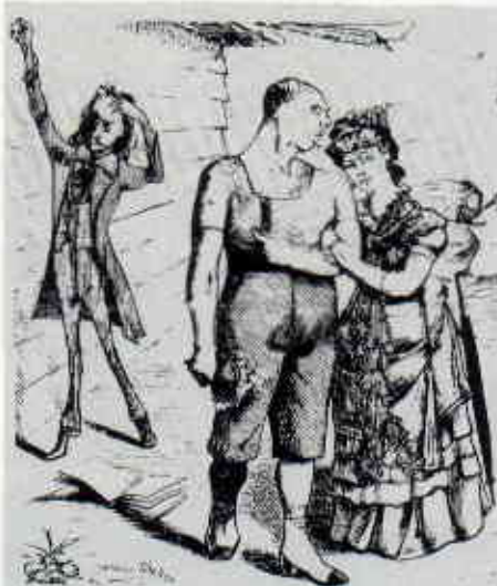
THE VICTORY OF MUSCLE OVER MIND

THE BALTIMORE BATTLERS SPORTS GAME LEAGUE