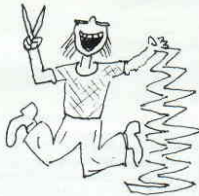
Plan B Unfolds

As you know, Plays 17, 18, 19 and 20 may not be called when the ball rests between the defender's 1-20 yard lines inclusive, and Plays 13, 14, 15 and 16 may not be called when the ball rests between the defender's 1-10 yard lines inclusive. For