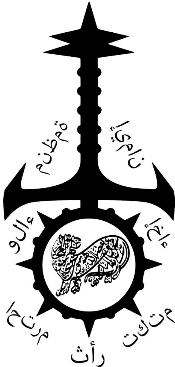
Khabar Tattoo Example by Caroline Berta Instagram: @crow.witch Facebook: Crow Scratch

The internal workings of the Unconquered are not for those outside of the blood. The true history and legacy of the bloodline are not for outsiders. The secrets of Dur-An-Ki and other secret arts of the blood are only for those deemed worthy by the Unconquered. While those with them in the sect should not be pursued; those found among the blood to be teaching the secrets of the Unconquered to the outsiders can expect to be punished by the Shakari and Hulul himself if they find the teaching not above par.