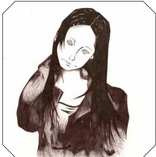
'Caitiff' Tim Thomas Pen & Marker on Paper

There exists no official Anarch College of Sorcery. Such a facility would be highly difficult to establish, given the dissimilar nature of the different Waves that make up such sorcery. Those individuals who specialize in Anarch magic are extremely protective of their occult knowledge and do not regularly teach it. As a result, those members of the Movement who want to learn such things must actively seek those experts out, often at great personal risk.