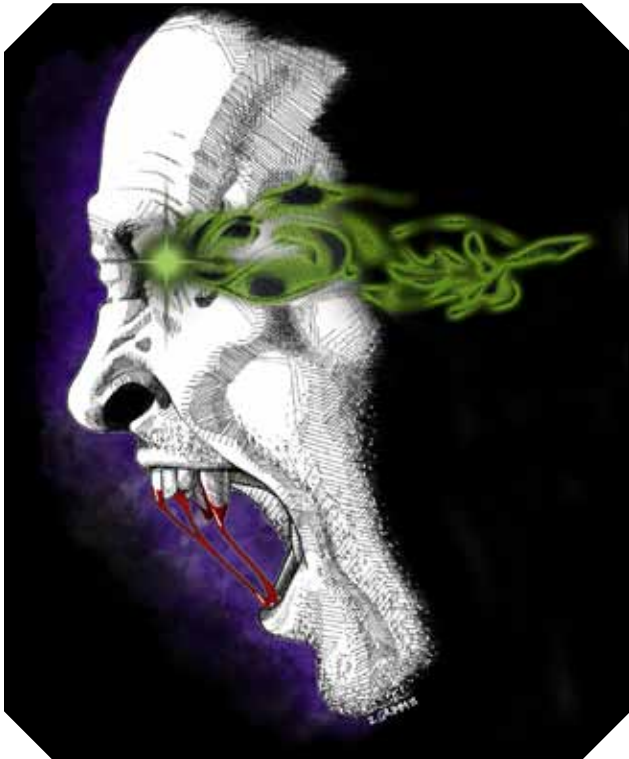
'Untitled' Zuri Grimm - artpunxstudio.com Mixed Media