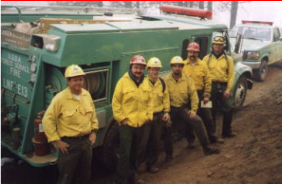
Lassen National Forest Engine 1-3 and crew after a long night on a fire (7/97)