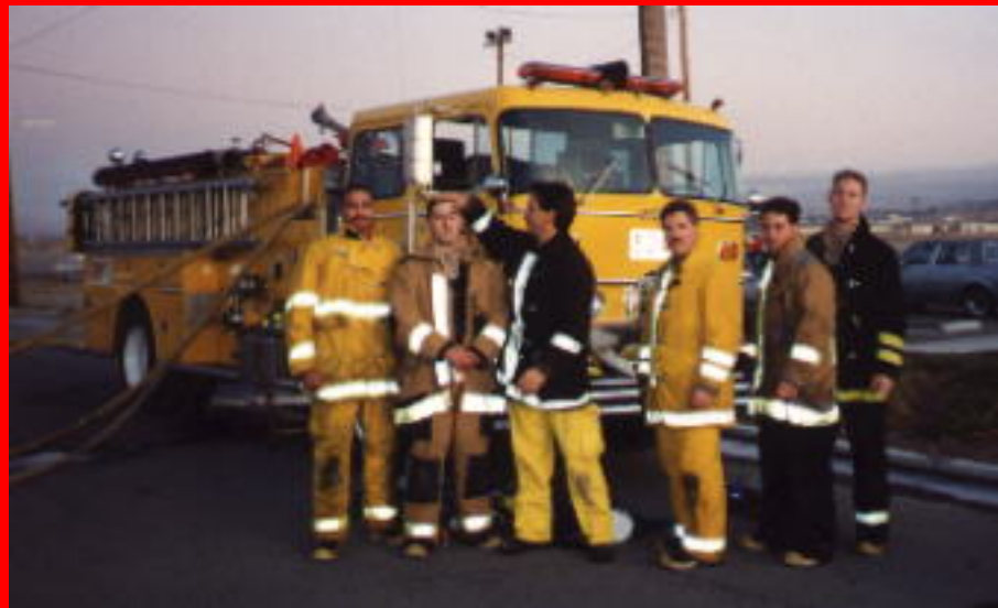
Alameda County Fire Department Engine 5241 and crew after a structure fire (7/95)