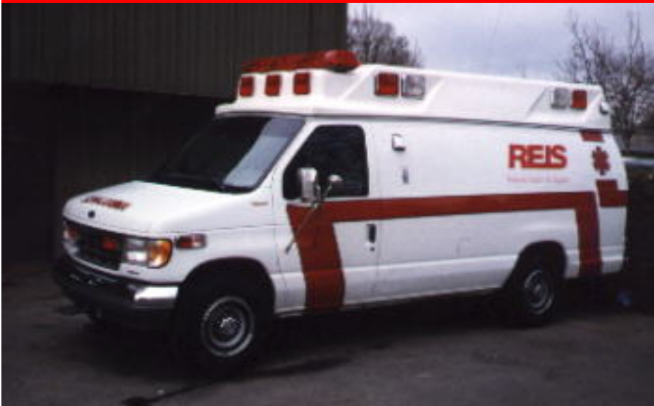
Redwood Empire Life Support Medic 52