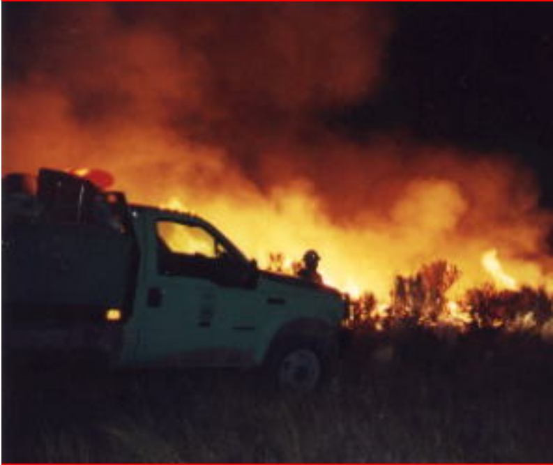
Coronado National Forest Engine 32 on a fire while detailed to Elko, NV (8/99)