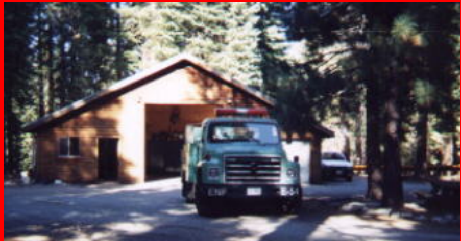
Eldorado National Forest Engine 5-4 in front of station (6/96)