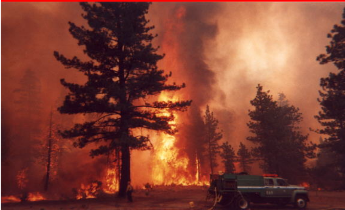
Sequoia National Forest Engine 65 on the Manter fire, Sequoia NF, CA (7/2000)

I've worked for the U.S. Forest Service since 1996, during this time I have worked on the Eldorado and Lassen National Forests in Northern California, the Coronado National Forest in South Eastern Arizona and now back to Central California on the Sequoia National Forest. Working for the Forest Service has allowed me to travel to fires in California, Arizona, New Mexico, Nevada, Texas and Mexico. Before working for the Forest Service I was a volunteer firefighter with the Alameda County fire department for about five years, a paid federal firefighter in Monterey, California for one year and I worked for a private ambulance company in Sonoma County for two years.