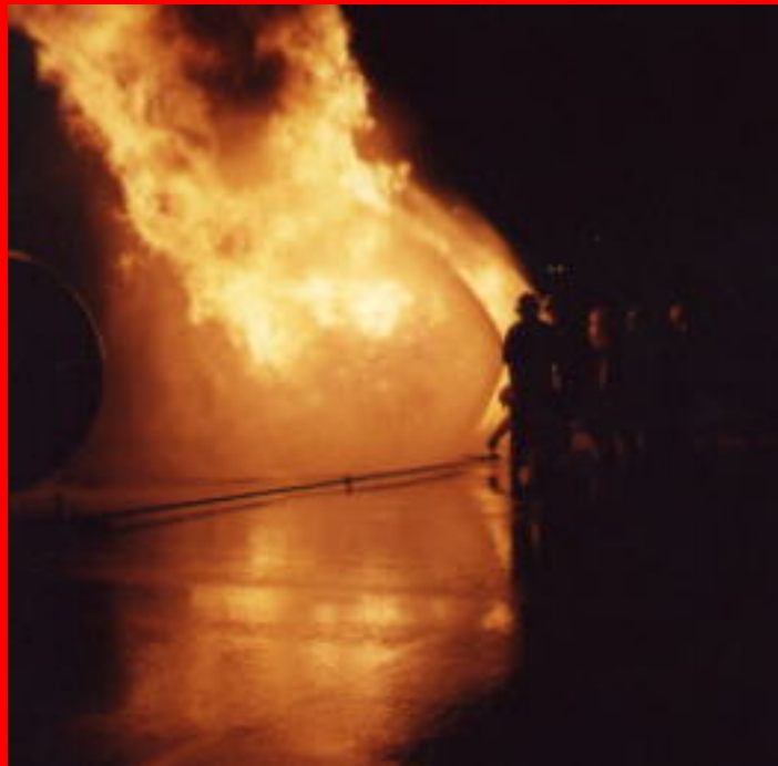
Propane fire training Alameda County Fire Department (9/94)