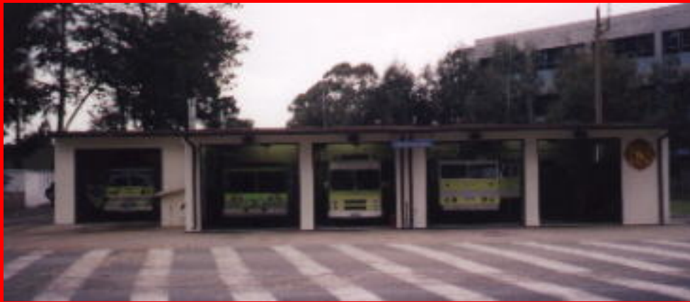
Naval Support Activity Monterey Bay Fire Dept. Station 1 (Naval Postgraduate School)