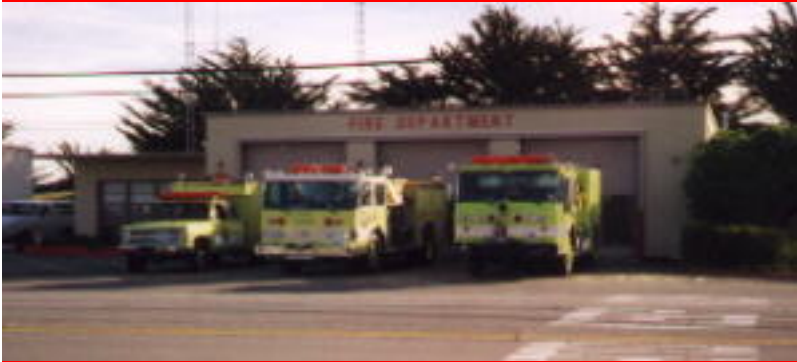
Naval Support Activity Monterey Bay Fire Dept. Station 2 (Ft. Ord)