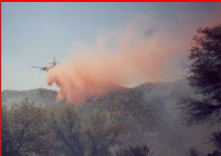
Tanker 55 (retired P2V Neptune) dropping retardant on a fire near the Arizona / Mexico border (5/99)