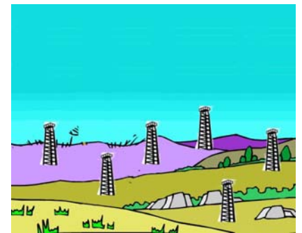
Resources Oil 86

The Resource is overlaid on other terrain.