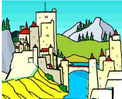
Noble Estate 82

The way ahead is Volcanic: molten interior rock emerging to the surface. The territory is similar to Mountain. Surface progress is slow and severely restricted. There may be occasional vegetation.