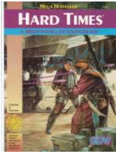
HARD TIMES A MegaTraveller Sourcebook