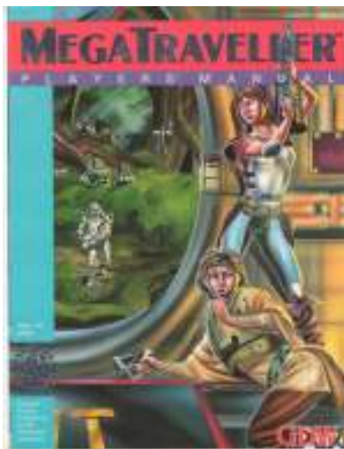
PLAYER'S MANUAL The Player's Resource

Traveller is the name of the overall game. MegaTraveller is the name of this rules set, and is used to differentiate it from the 10 years of development and earlier editions that preceded it.