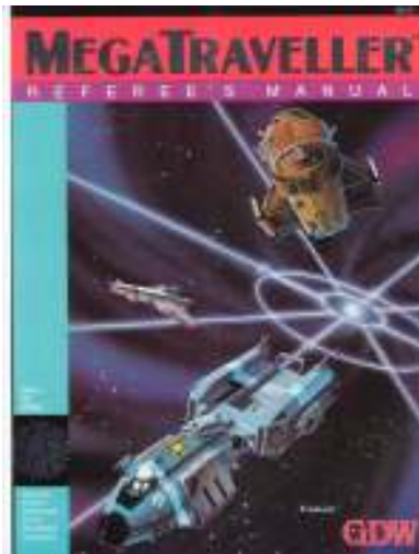
REFEREE'S MANUAL The Game Master's Resource