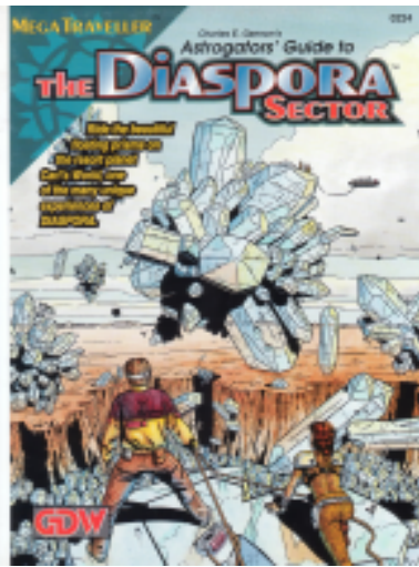
ASTROGATOR'S GUIDE TO THE DIASPORA SECTOR