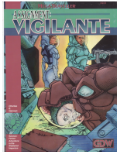
ASSIGNMENT: VIGILANTE Starmercs against Piracy

Inevitably, aftermaths are longer than the wars that cause them. The War of the Rebellion is no exception.