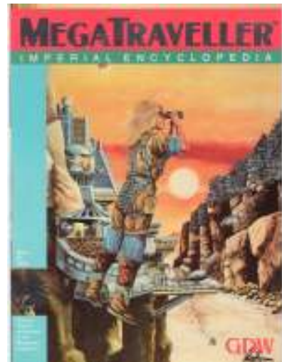
IMPERIAL ENCYCLOPEDIA Details of the Universe