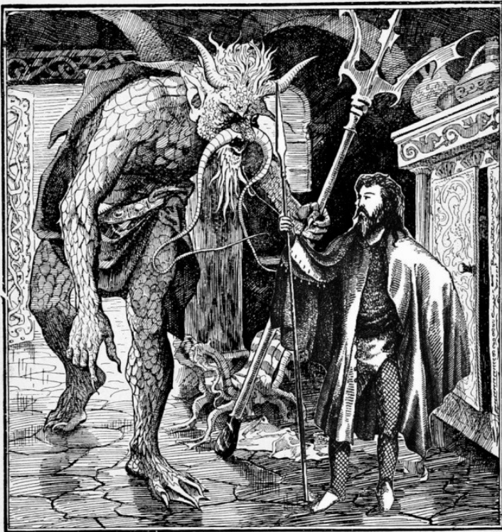
Azon the Ravenous

Demon, Ashtarath the Bright: HD 11; AC -1[20]; Atk 2 claws (1d4), 1 bite (1d6+2); Move 9 (Fly 14); Save 4; CL/XP 13/2300; Special: +1 or better magic weapon needed to hit, magic resistance (65%), +2 on to-hit rolls, immune to fire, magical abilities.