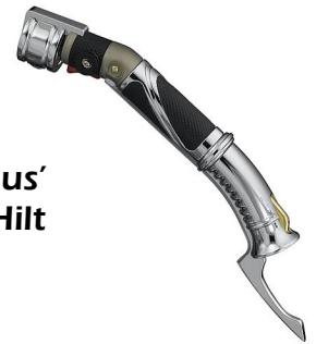
Darth Tyrannus' Lightsaber Hilt