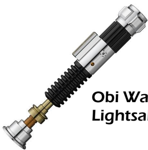
Obi Wan Kenobi's Lightsaber Hilt