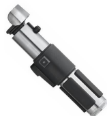
Jedi Master Yoda's Lightsaber Hilt