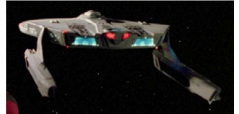
Lantree -subclass Light Cruiser

In other cases, the changes are significant enough to necessitate a new class entirely. For example, looking at the newer Shi'Kahr -class light cruiser next to any of the Miranda subclasses shows a definite similarity and design. This is especially true when compared to other light cruiser classes such as the Centaur class which is a completely independent design. In this case, though, the changes to the Shi'Kahr design are too significant to mark down as a subclass: this is a new class altogether.