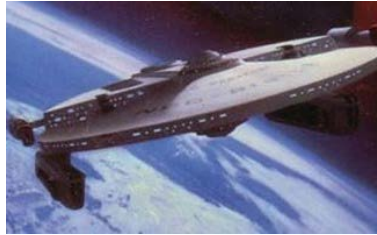
Saratoga -subclass Light Cruiser