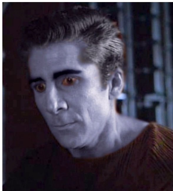
A gray-skinned Zuri Gral, or "Lesser"