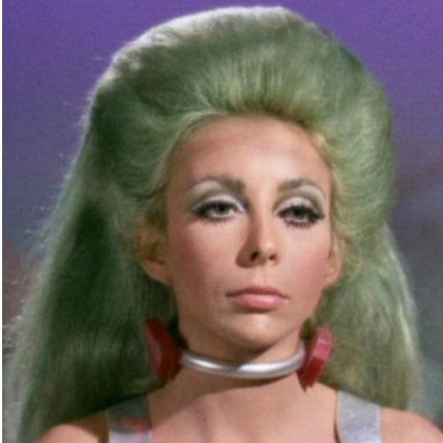
Shahna – an Orion-Human Triskelion Thrall