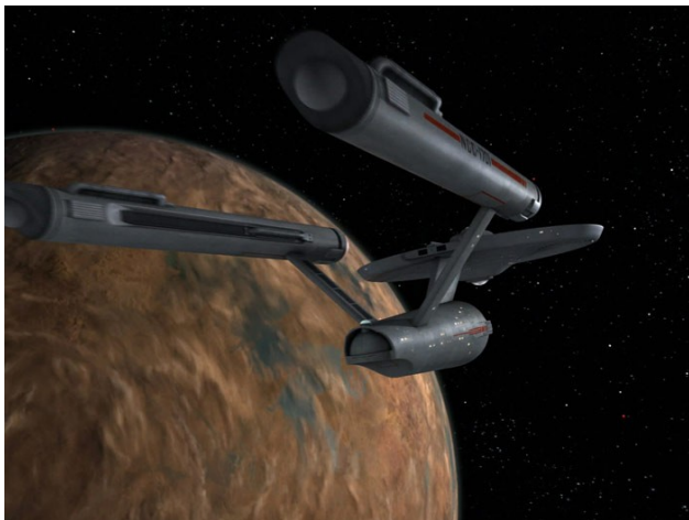
The USS Enterprise, in orbit around one of the many planets of the heavily populated Rigel star system.