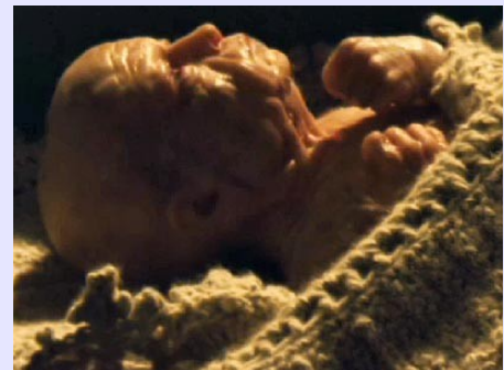
An Orkan Infant

An elderly Orkan will resemble a human teenager, or a child between the ages of 8-11. And a very old Orkan will have most of the physical characteristics of a toddler, or a child up to the age of 6.