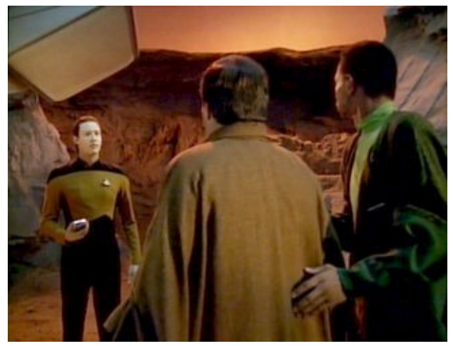
DATA MEETS FARITATH & KENTOR

It may be significant within Artemisian culture that Ard'rian McKenzie, the only female interacted with directly by Data, is also the only Artemisians with a surname. All the prominent males seem to use the mononymous forms.